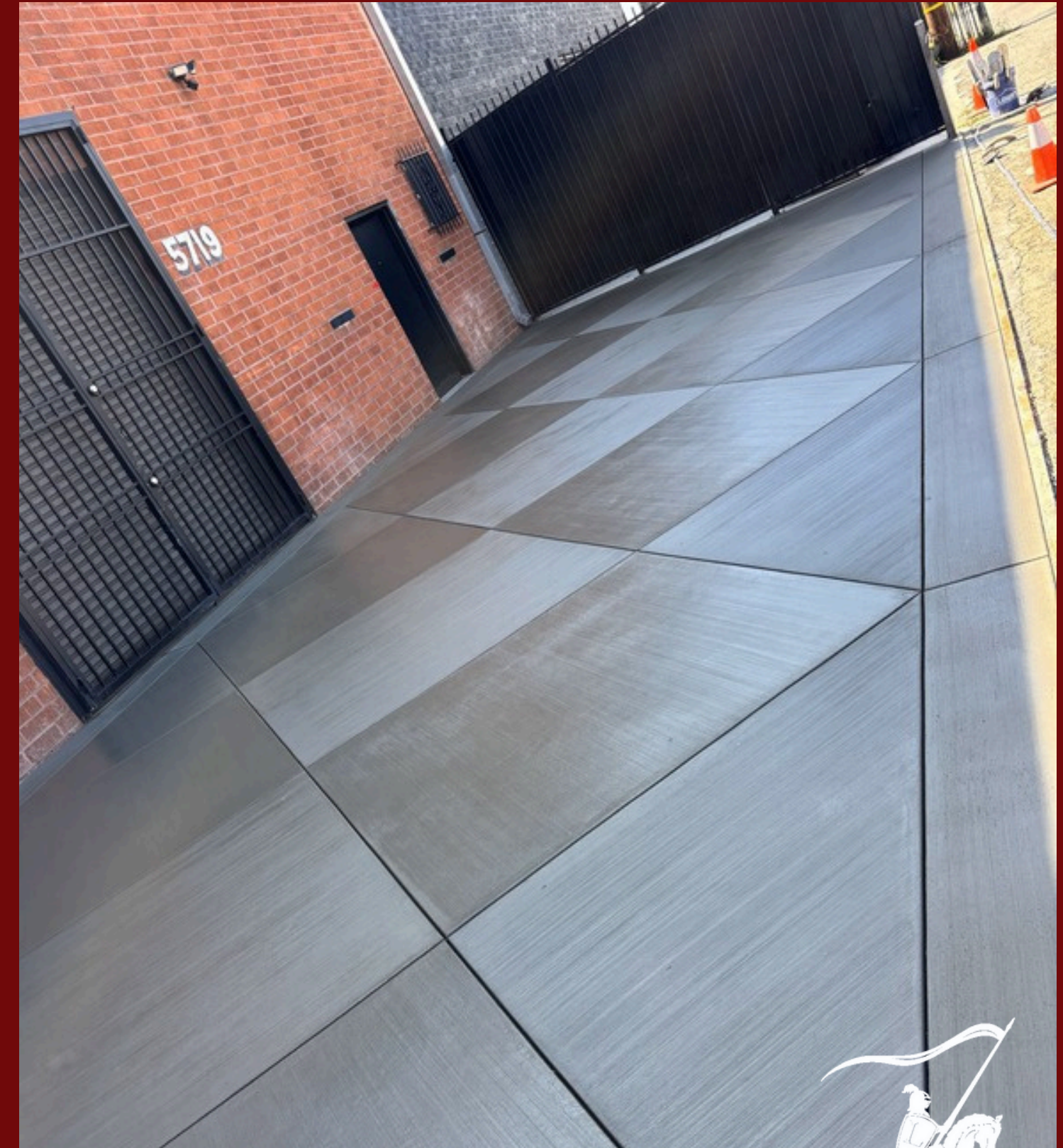
REAR GATED YARD