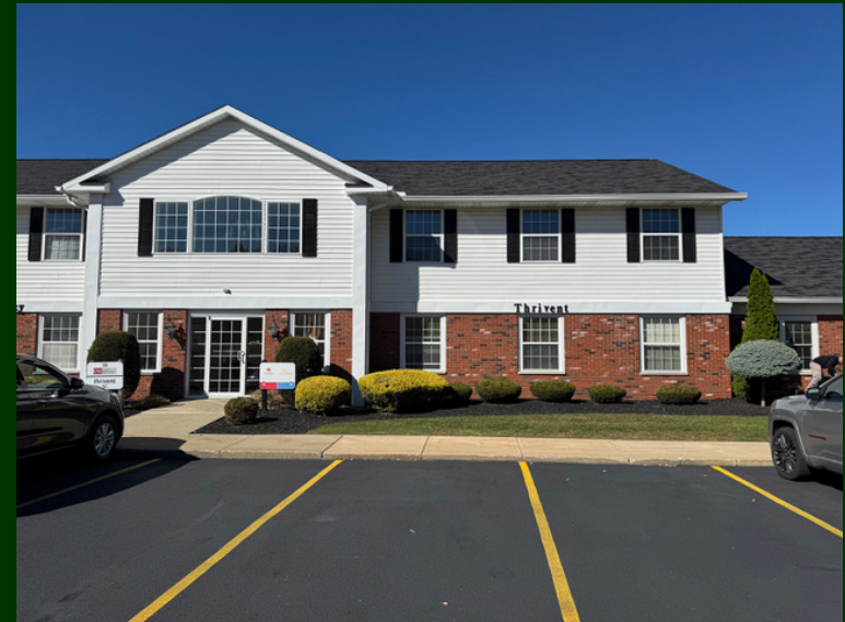
9930 Johnnycake Ridge Rd., #5H, Concord, OH 44077

No warranty or representation, express or implied, is made as to the accuracy of the information contained herein. It is submitted subject to errors, omissions, price changes, rental or other conditions, withdrawal without notice, and to any special listing conditions imposed by our client.