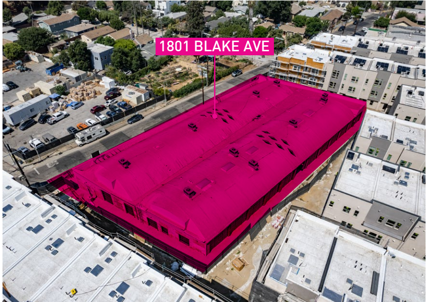
1801 BLAKE AVE