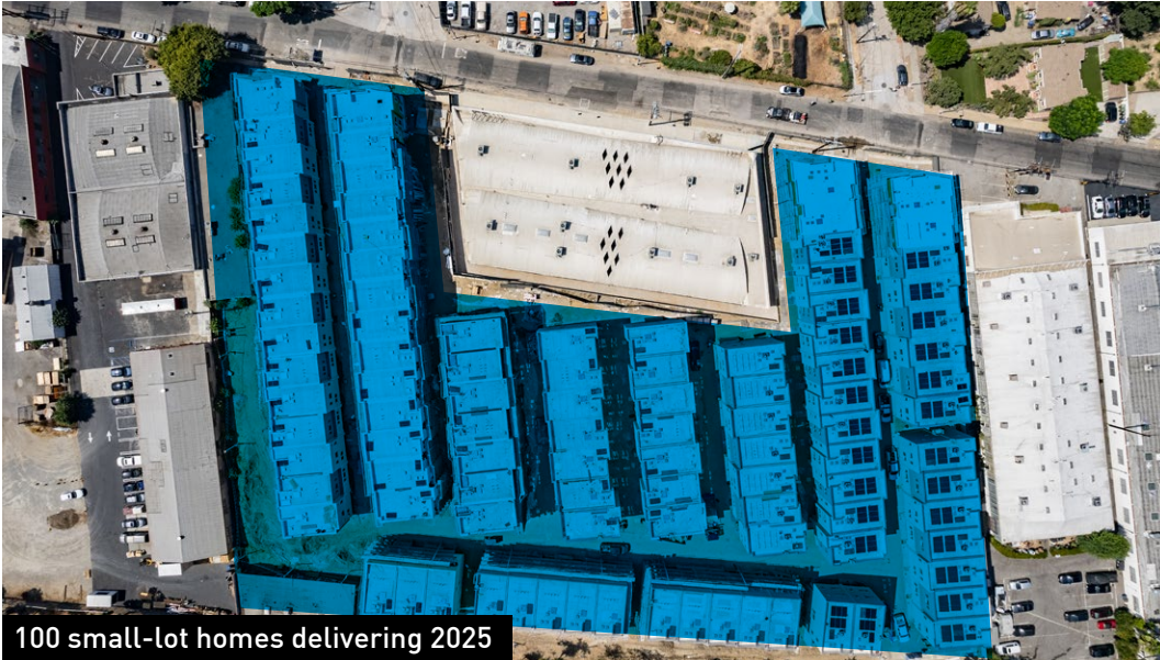
100 small-lot homes delivering 2025