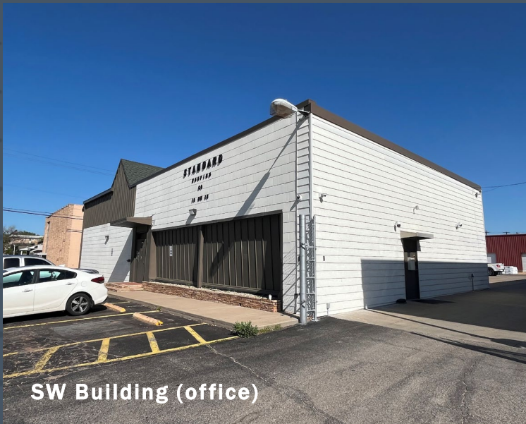
SW Building (office)