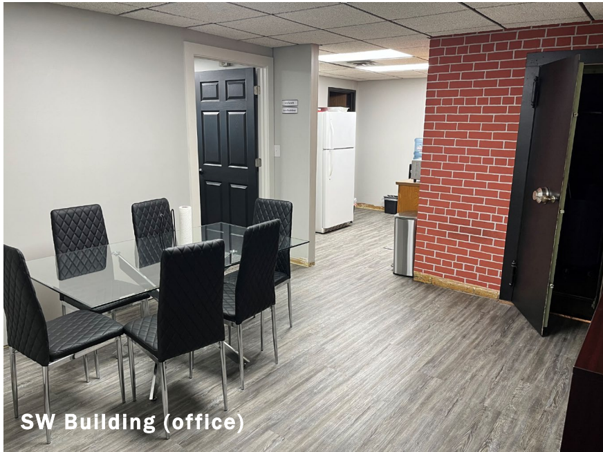
SW Building (office)