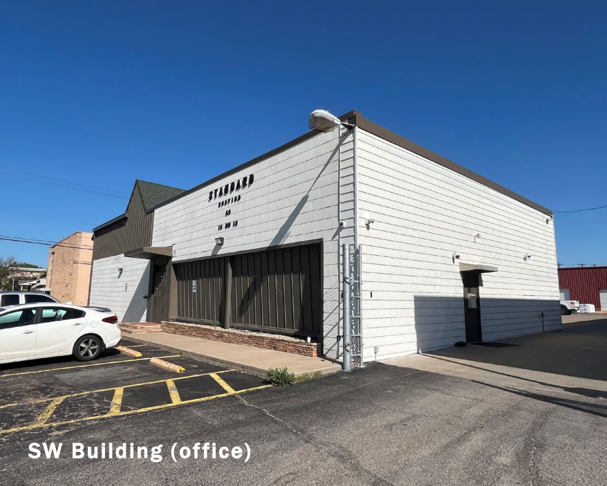
SW Building (office)