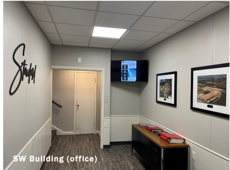
SW Building (office)