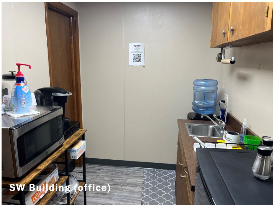
SW Building (office)