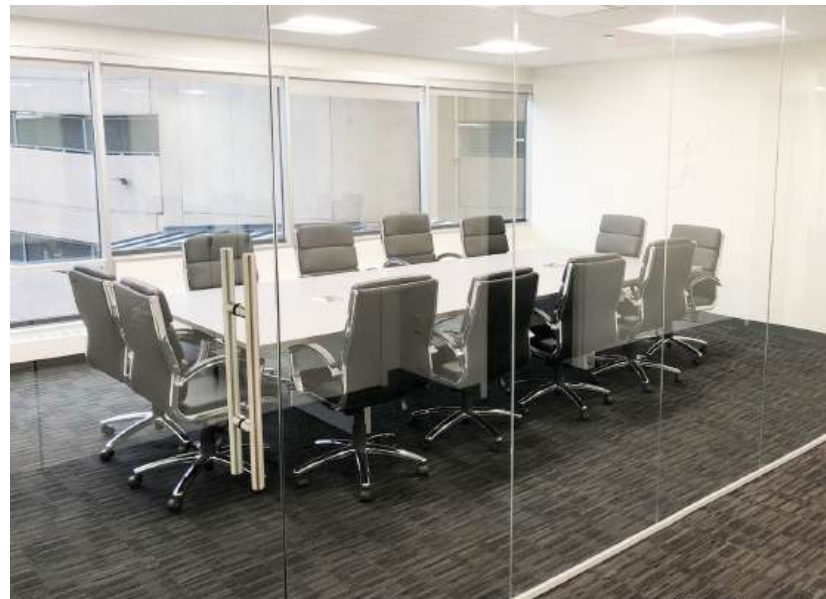
SECOND FLOOR / SUITE 250

The information contained herein has been obtained from sources deemed reliable but has not been verified and no guarantee, warranty or representation, either express or implied, is made with respect to such information. Terms of sale or lease and availability are subject to change or withdrawal without notice.