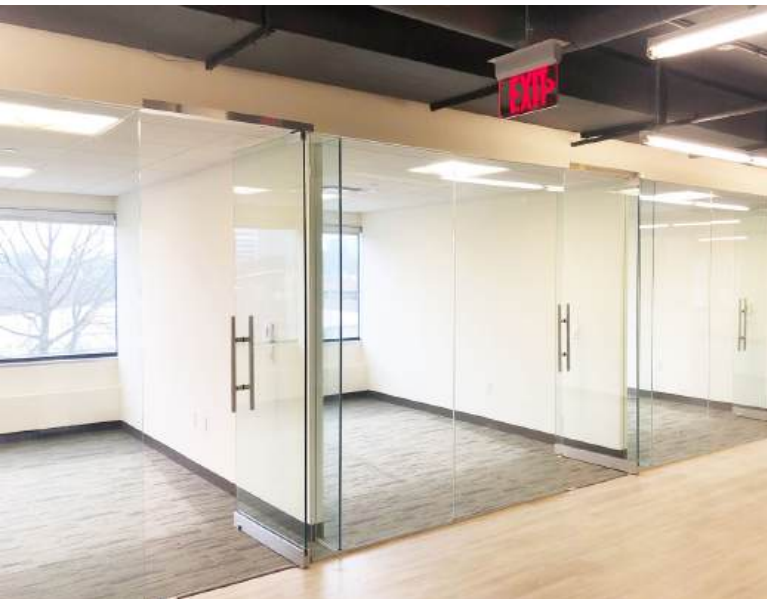
THIRD FLOOR / SUITE 300