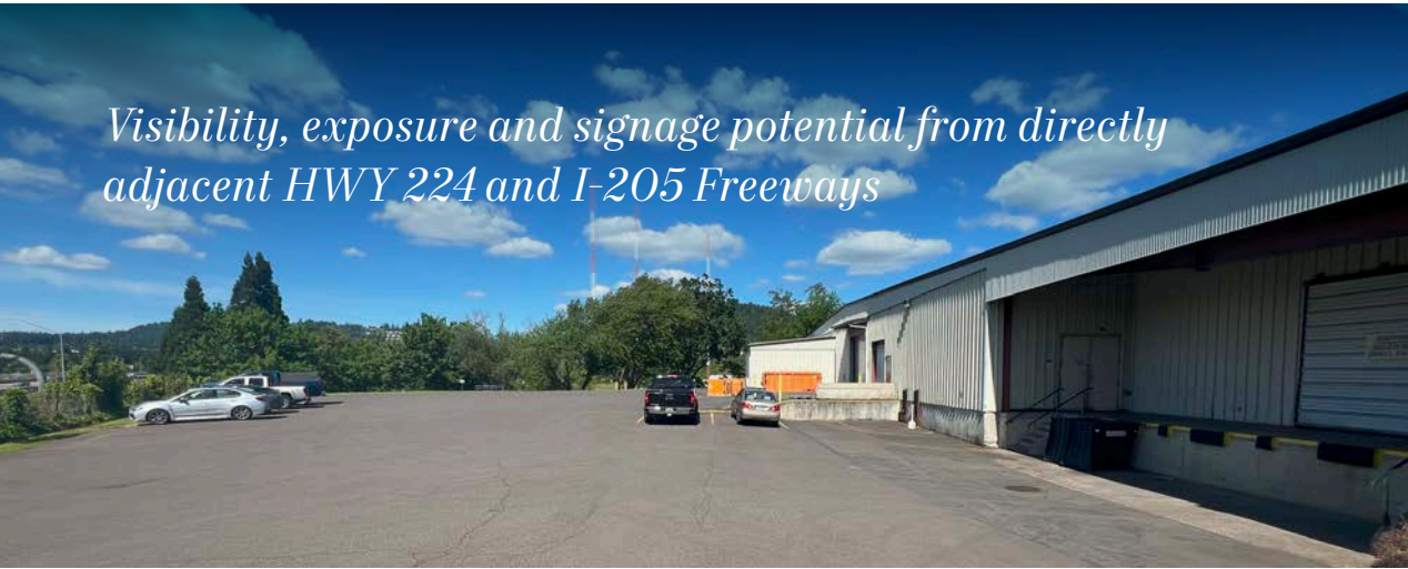
Visibility, exposure and signage potential from directly adjacent HWY 224 and I-205 Freeways