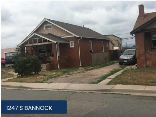
1247 S BANNOCK