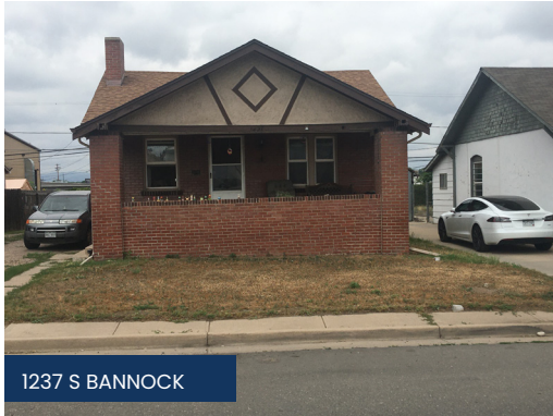
1237 S BANNOCK