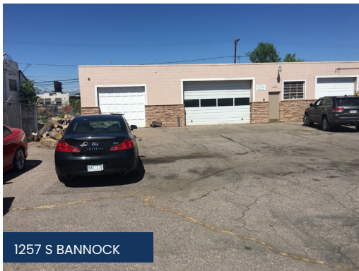
1257 S BANNOCK