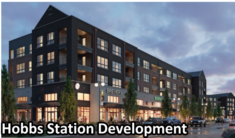
Hobbs Station Development