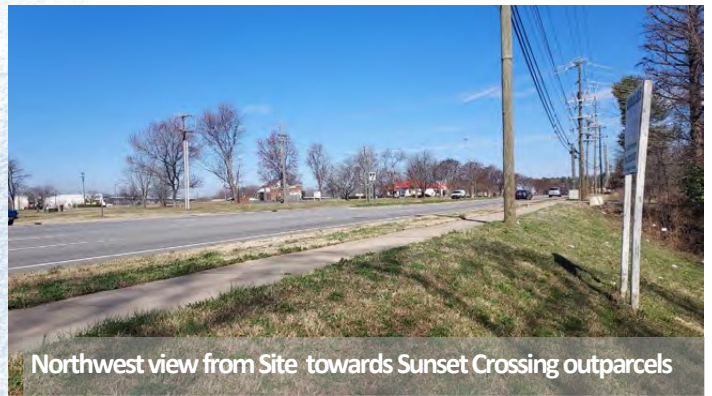
Northwest view from Site towards Sunset Crossing outparcels