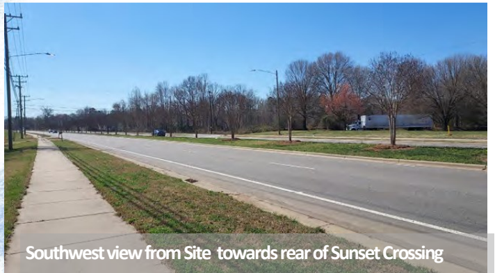
Southwest view from Site towards rear of Sunset Crossing