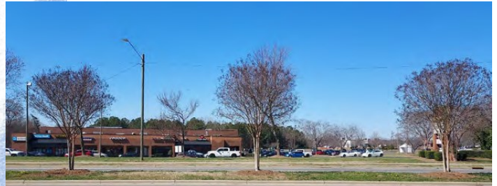
View from site facing west to Sunset Crossing Shopping Center