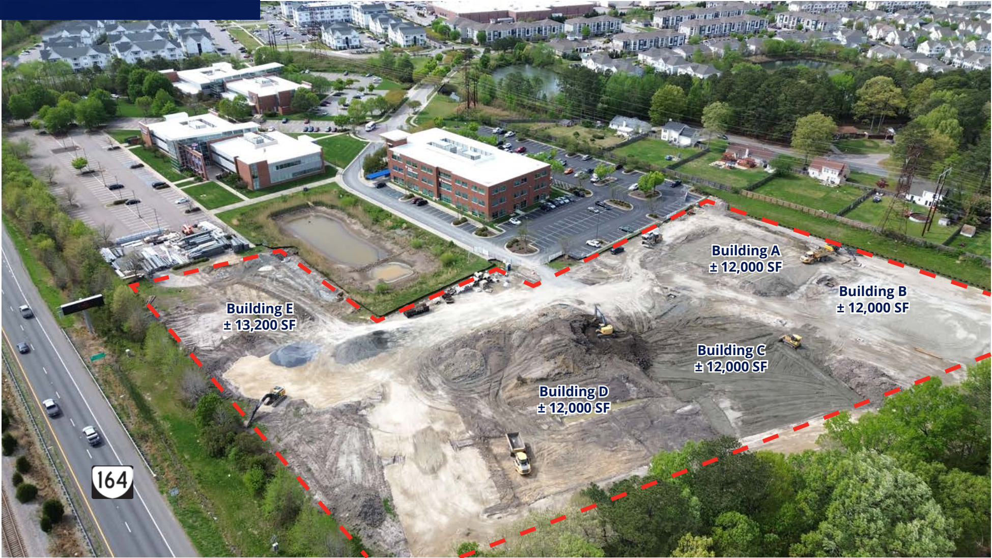
1050 University Blvd, Portsmouth, VA