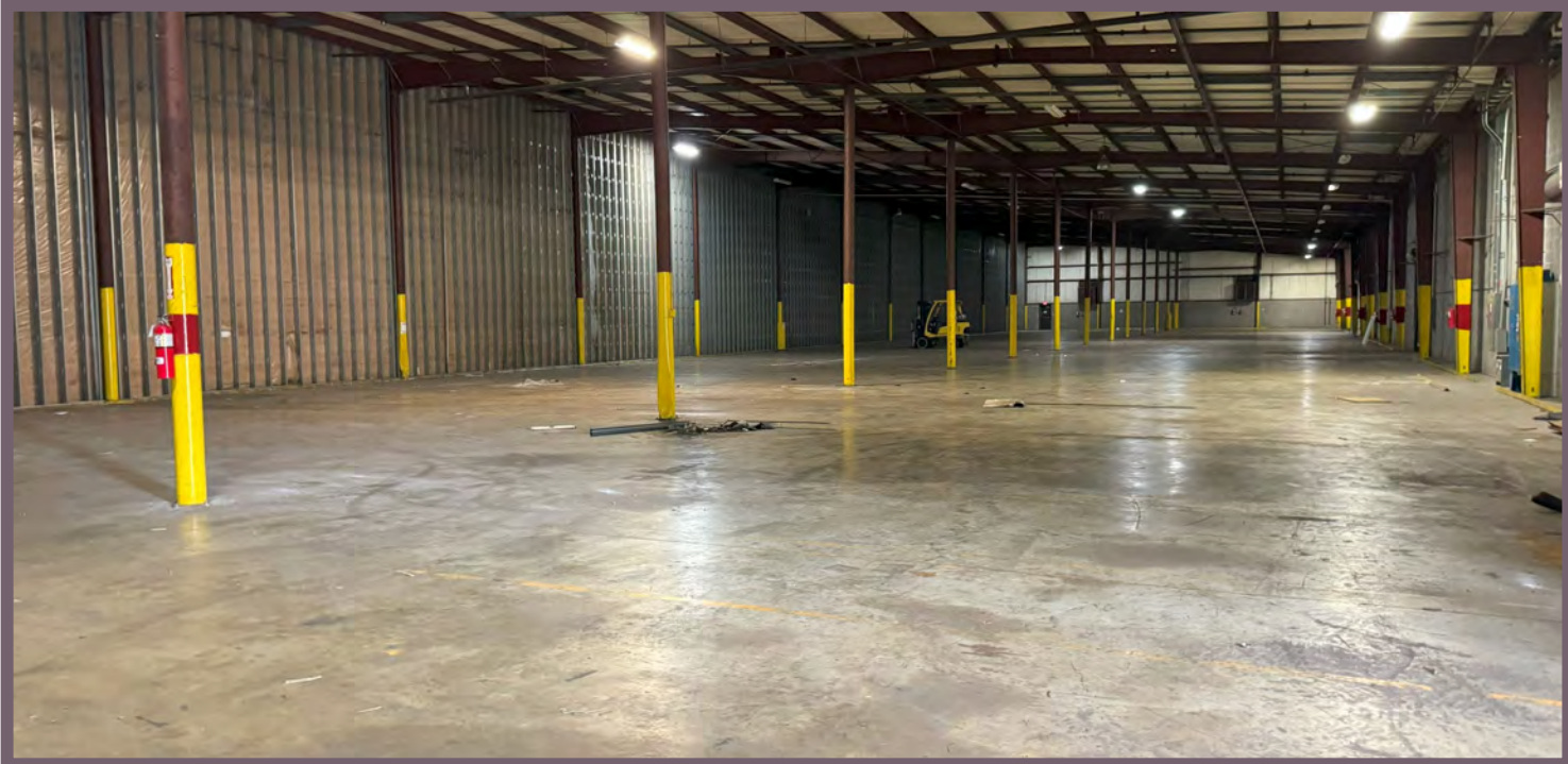
Warehouse Section 3