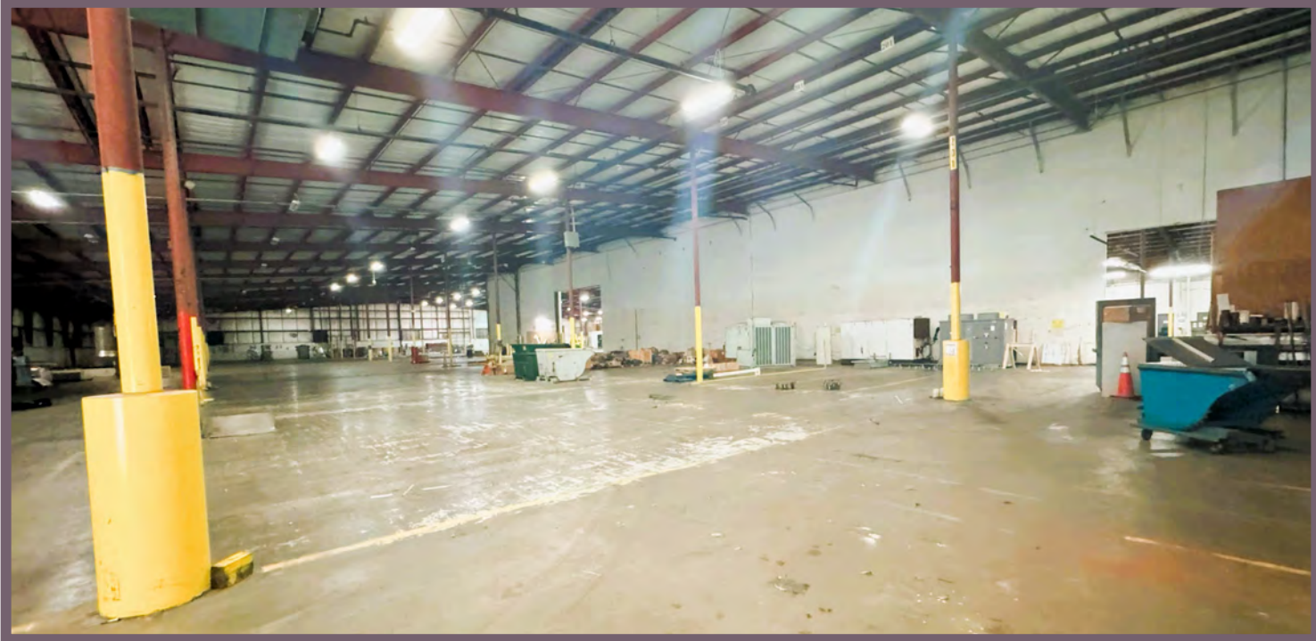
Warehouse Section 2