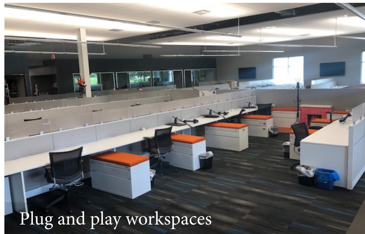
Plug and play workspaces