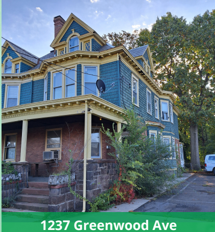
1237 Greenwood Ave

FOR INFO CONTACT: CHARLES TEH 609-394-7557 X 113 CHARLES@SEGAL-LABATE.COM