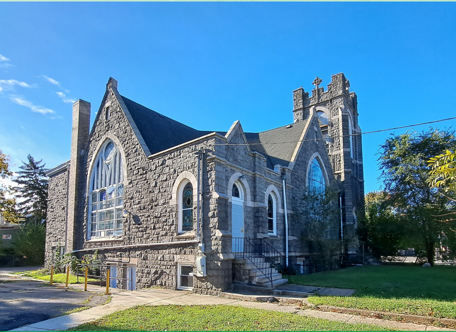
1201 Greenwood Ave Trenton, NJ

Corner of Greenwood Avenue (RT 33 & S Olden Ave)