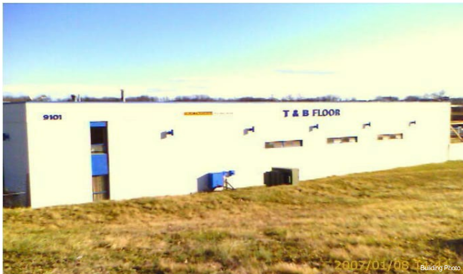
2007/03/06 Building Photo