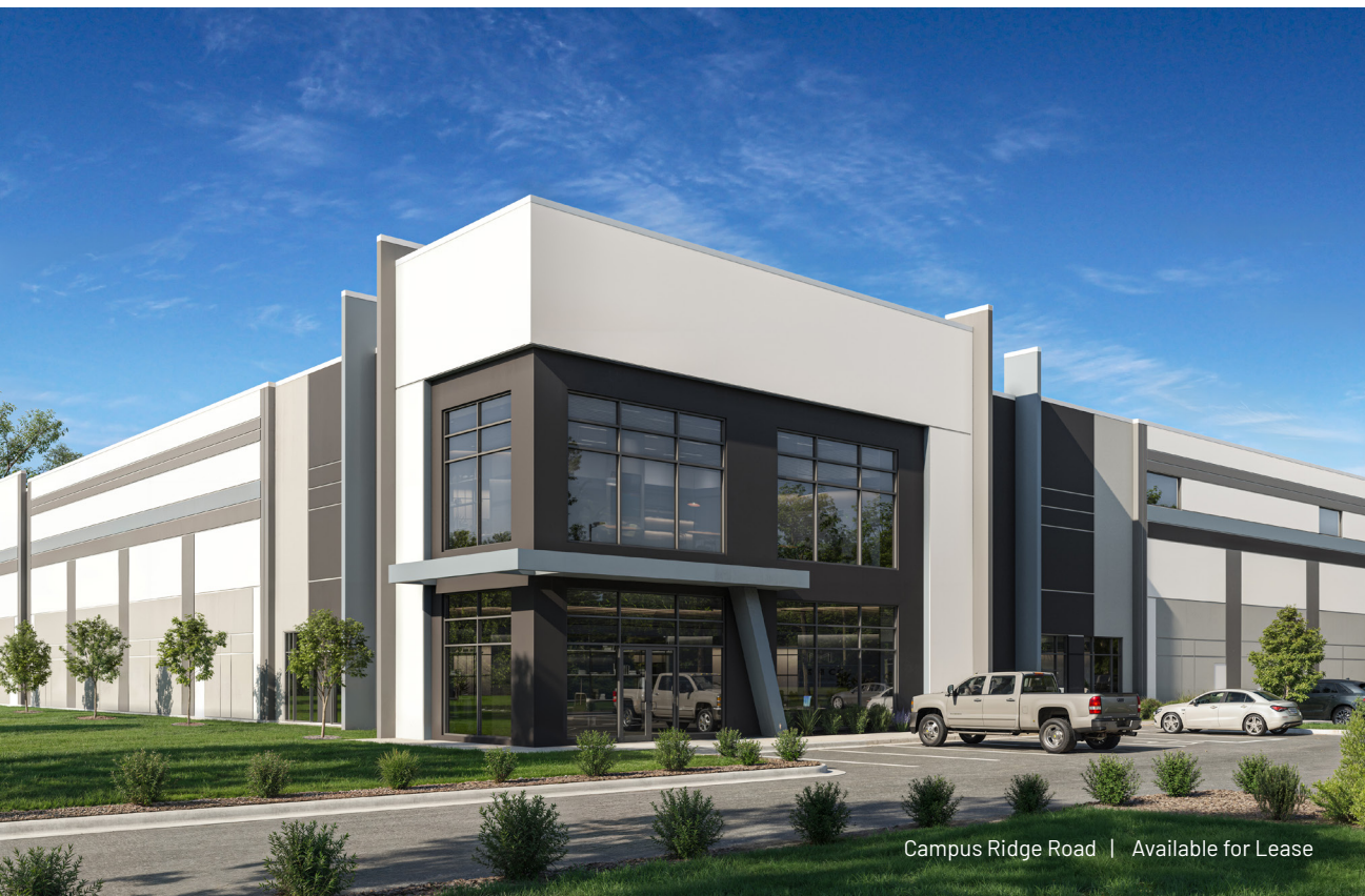
Campus Ridge Road | Available for Lease