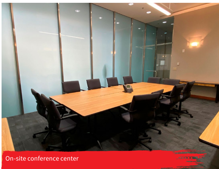
On-site conference center