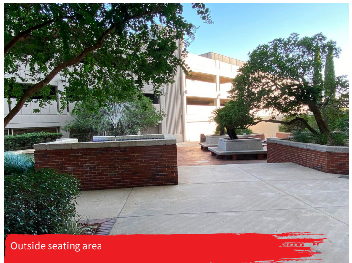
Outside seating area