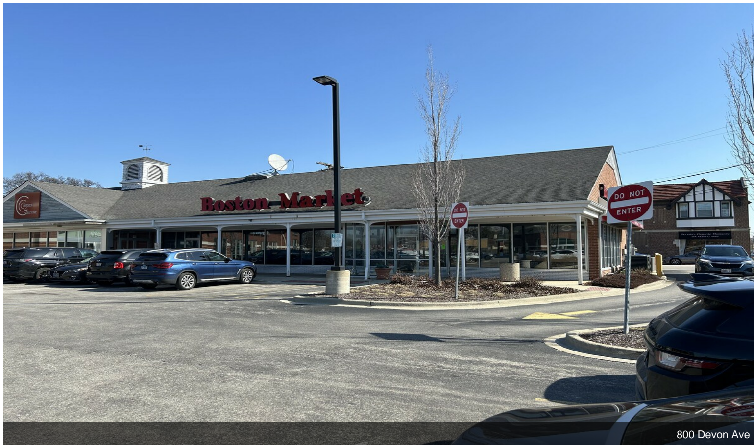
800 Devon Ave