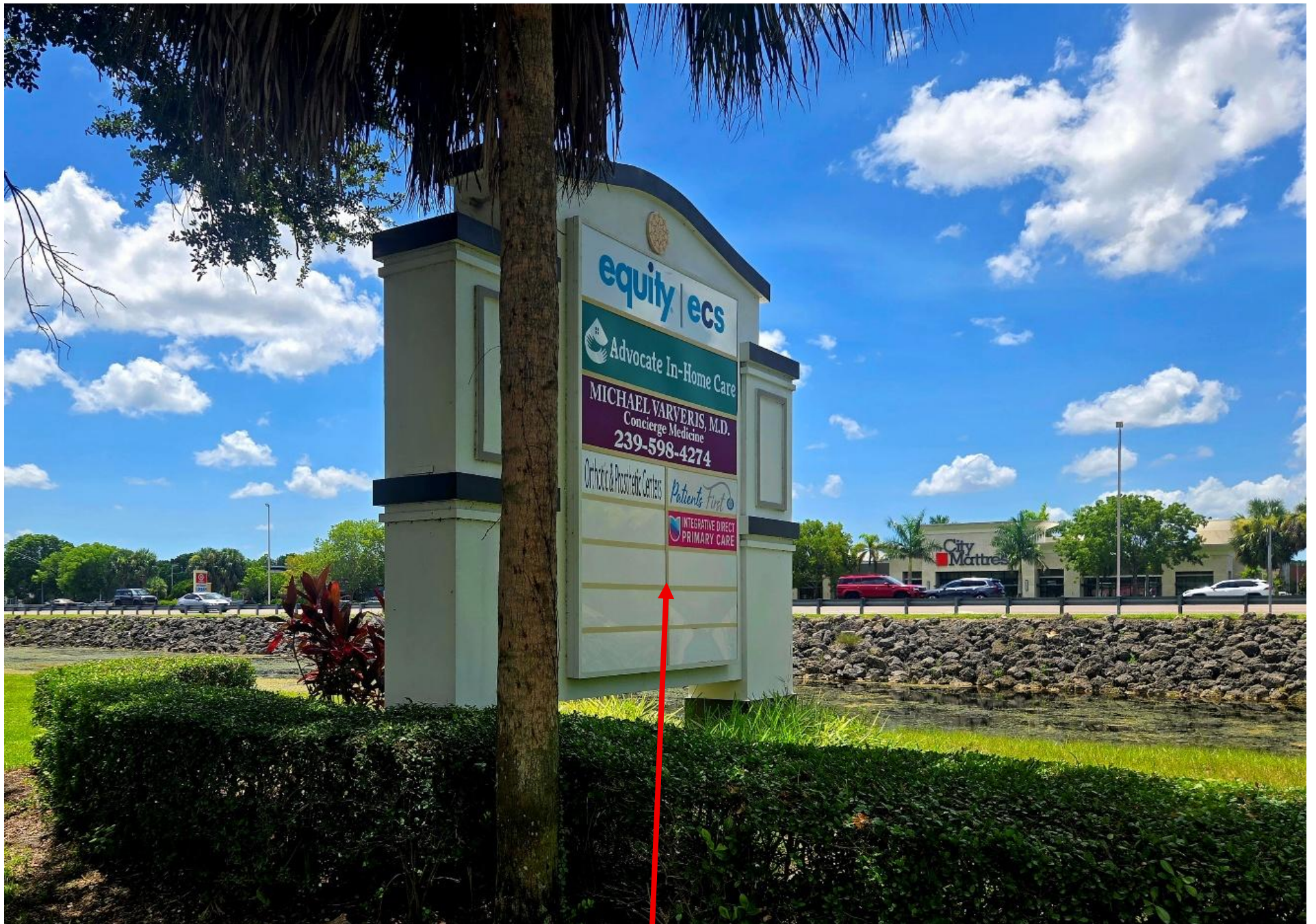
MONUMENT SIGN SPACE AVAILABLE. VISIBLE FROM IMMOKALEE RD.