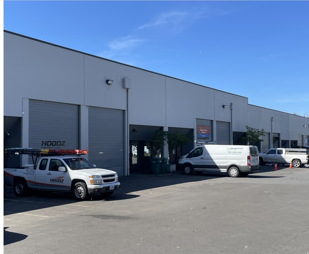
9852 SE Empire Court, Suite B