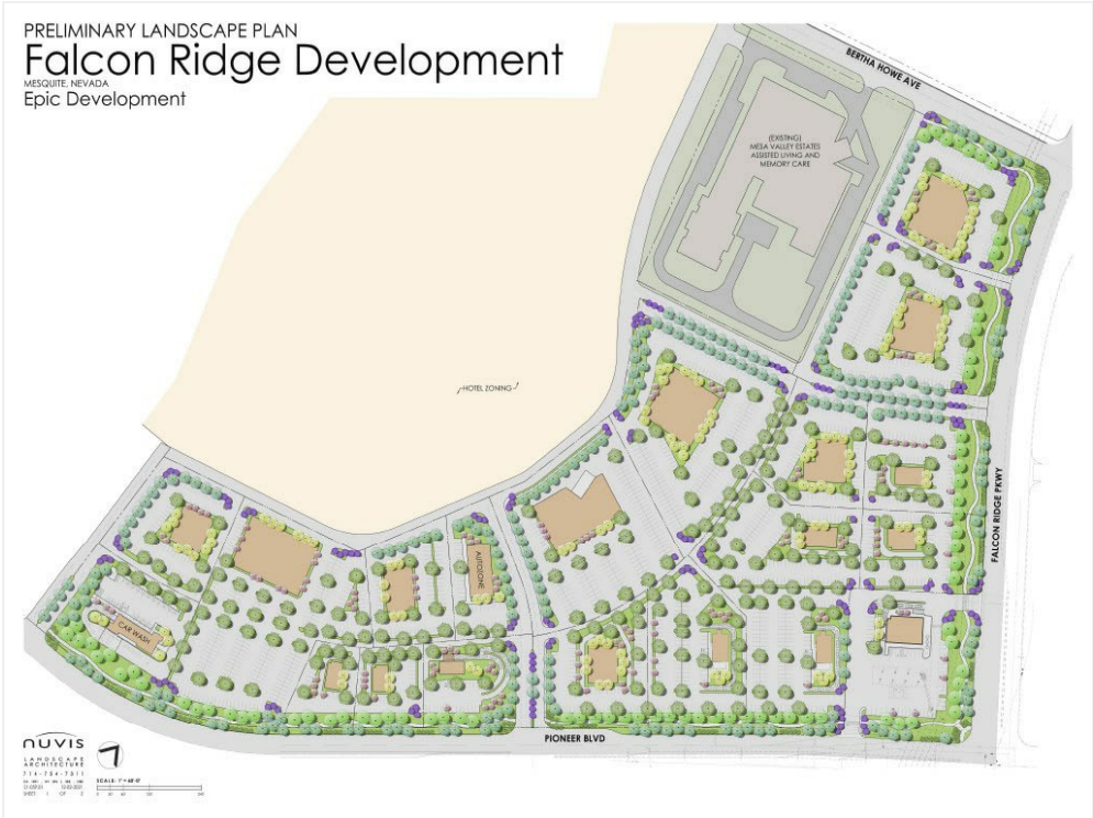
Preliminary Landscape Plan - 12-02-2021