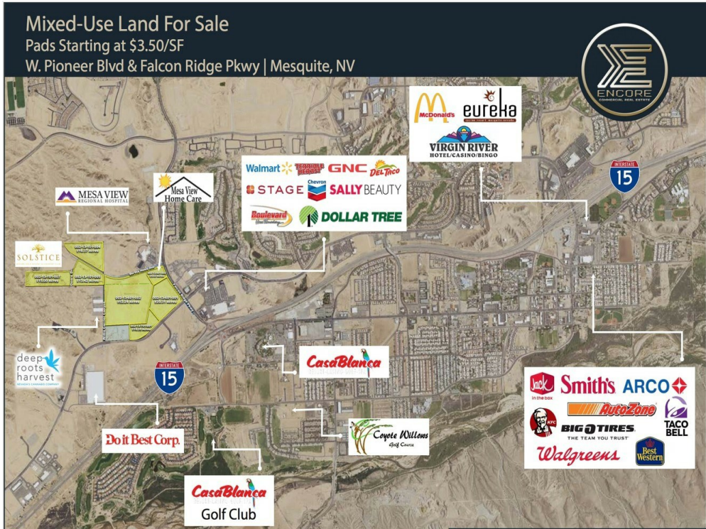
MESQUITE PG 1