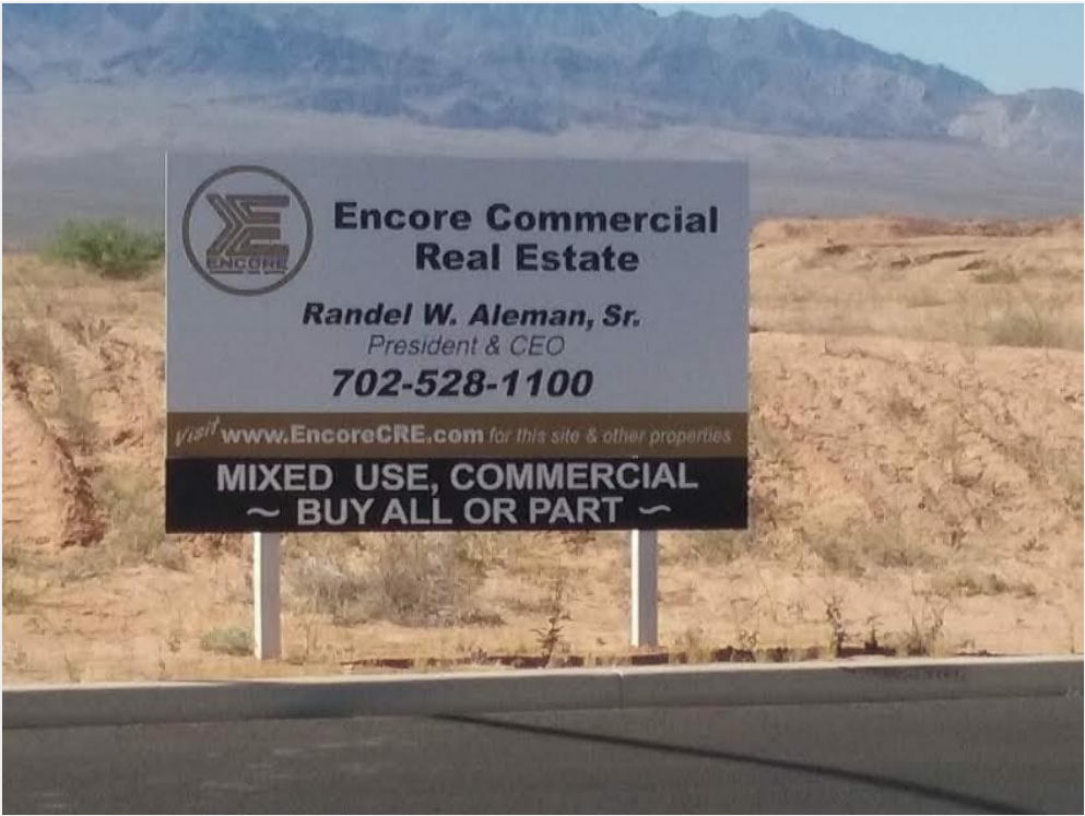
Photo 1 - Sign near Hospital