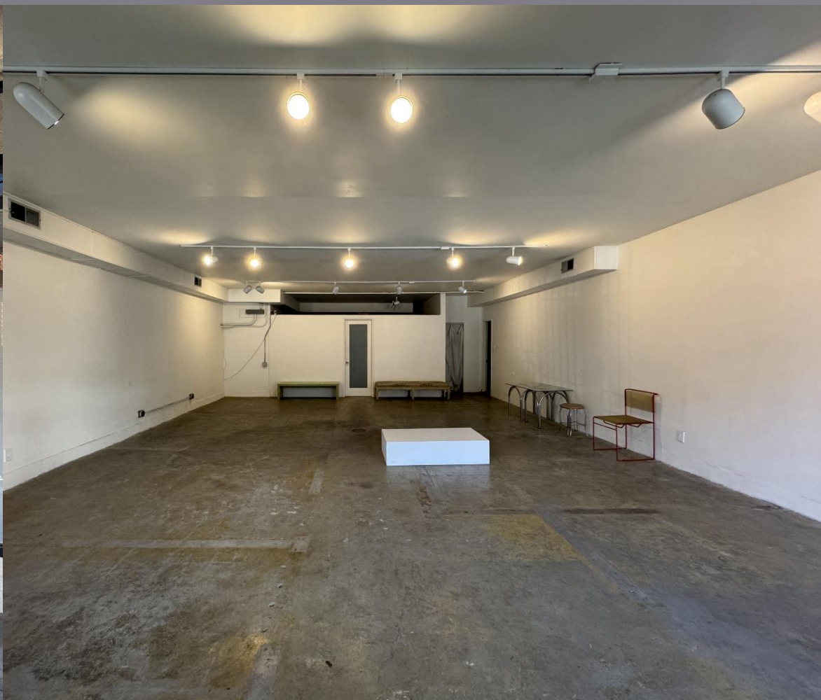
628 College-Bruce Lee Dojo