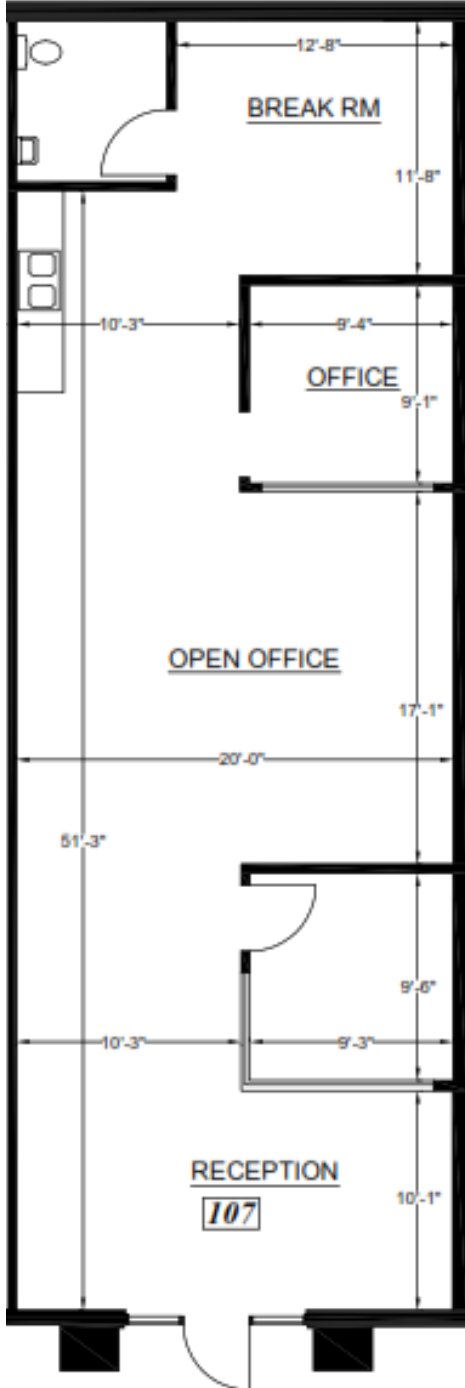
Floor Plan is not to scale; for reference purposes only.