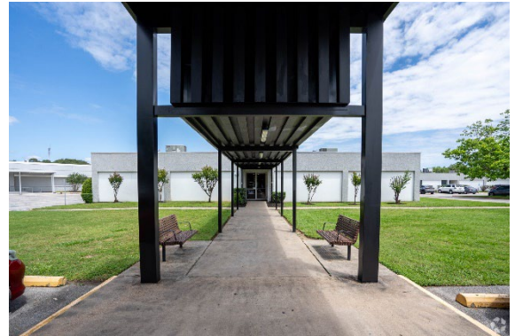
1600 - 1610 Connecting Canopied Walkway