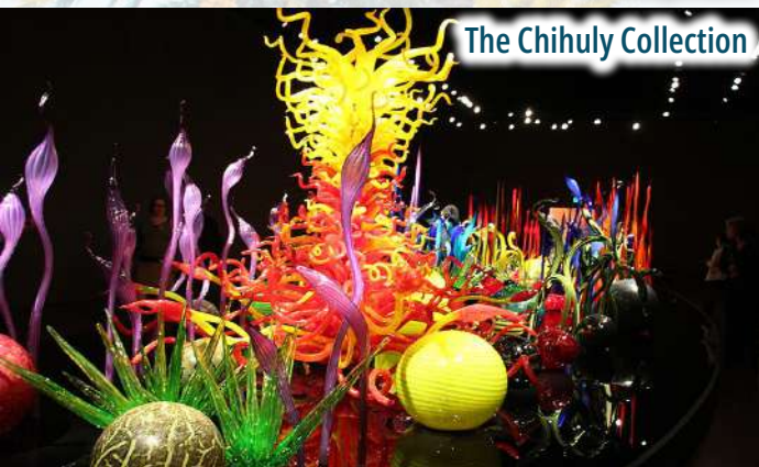
The Chihuly Collection

Miami's "Rival for the Finer Things" -The Independent