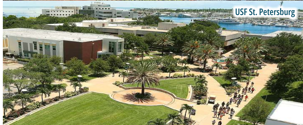
USF St. Petersburg