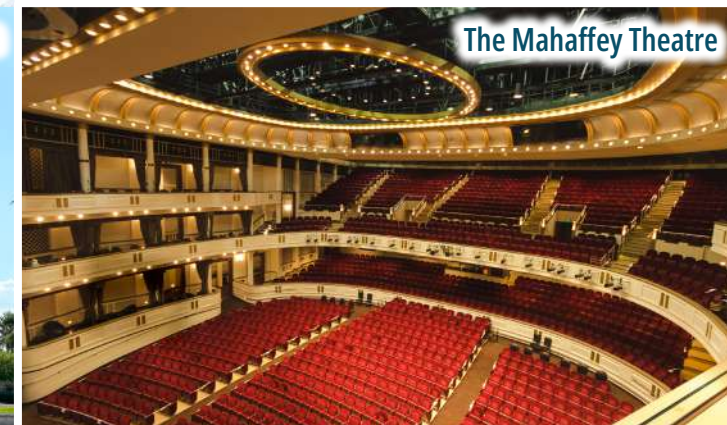
The Mahaffey Theatre