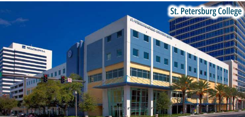
St. Petersburg College