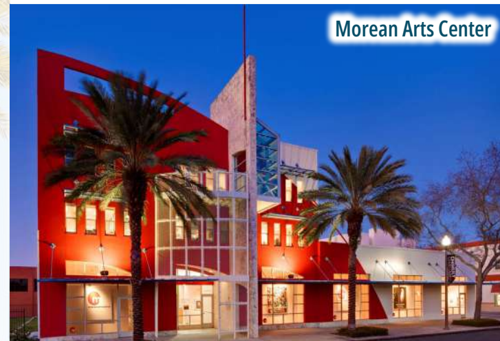
Morean Arts Center