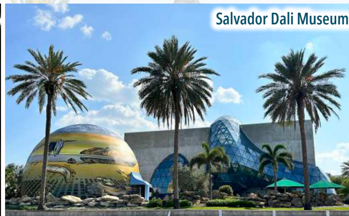
Salvador Dali Museum