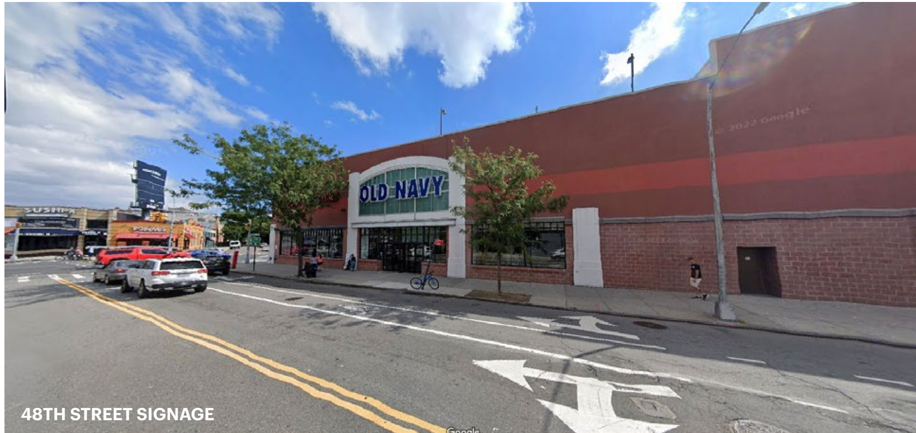
48TH STREET SIGNAGE