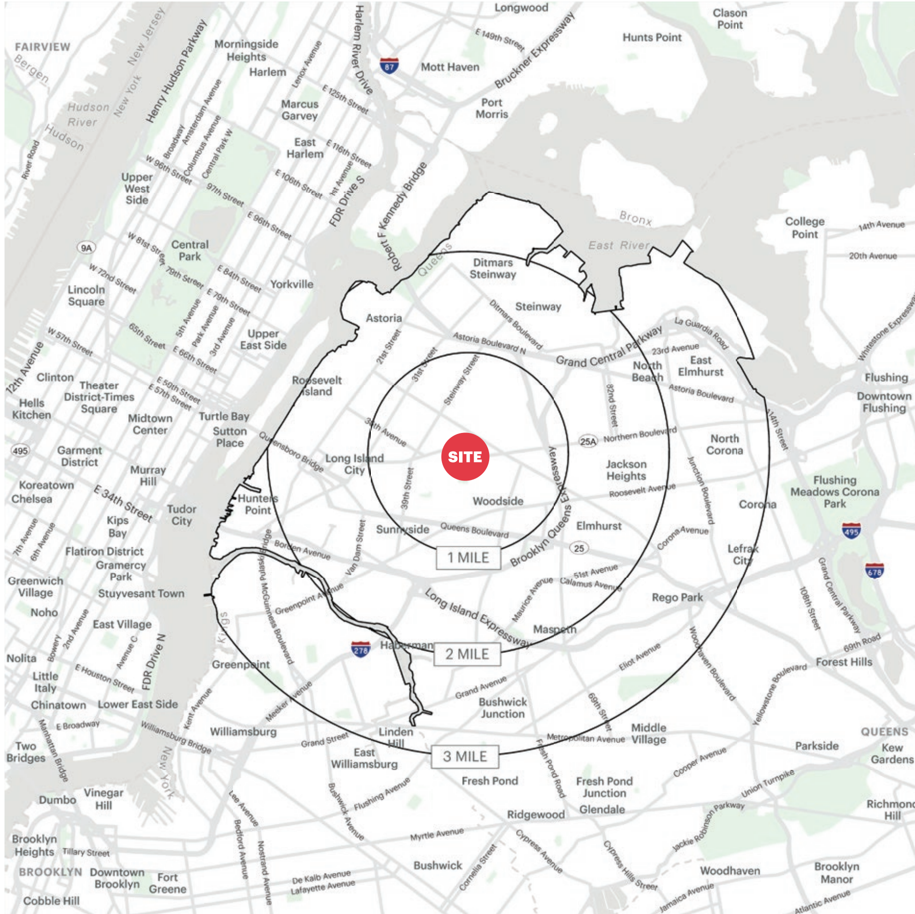
SHOPS AT NORTHERN BOULEVARD LONG ISLAND CITY, NEW YORK