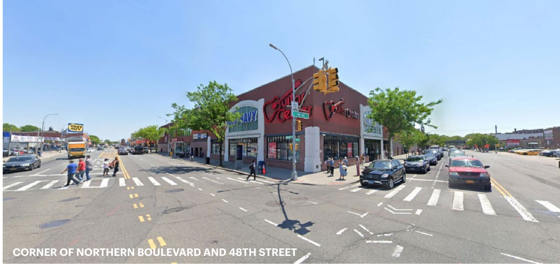
CORNER OF NORTHERN BOULEVARD AND 48TH STREET