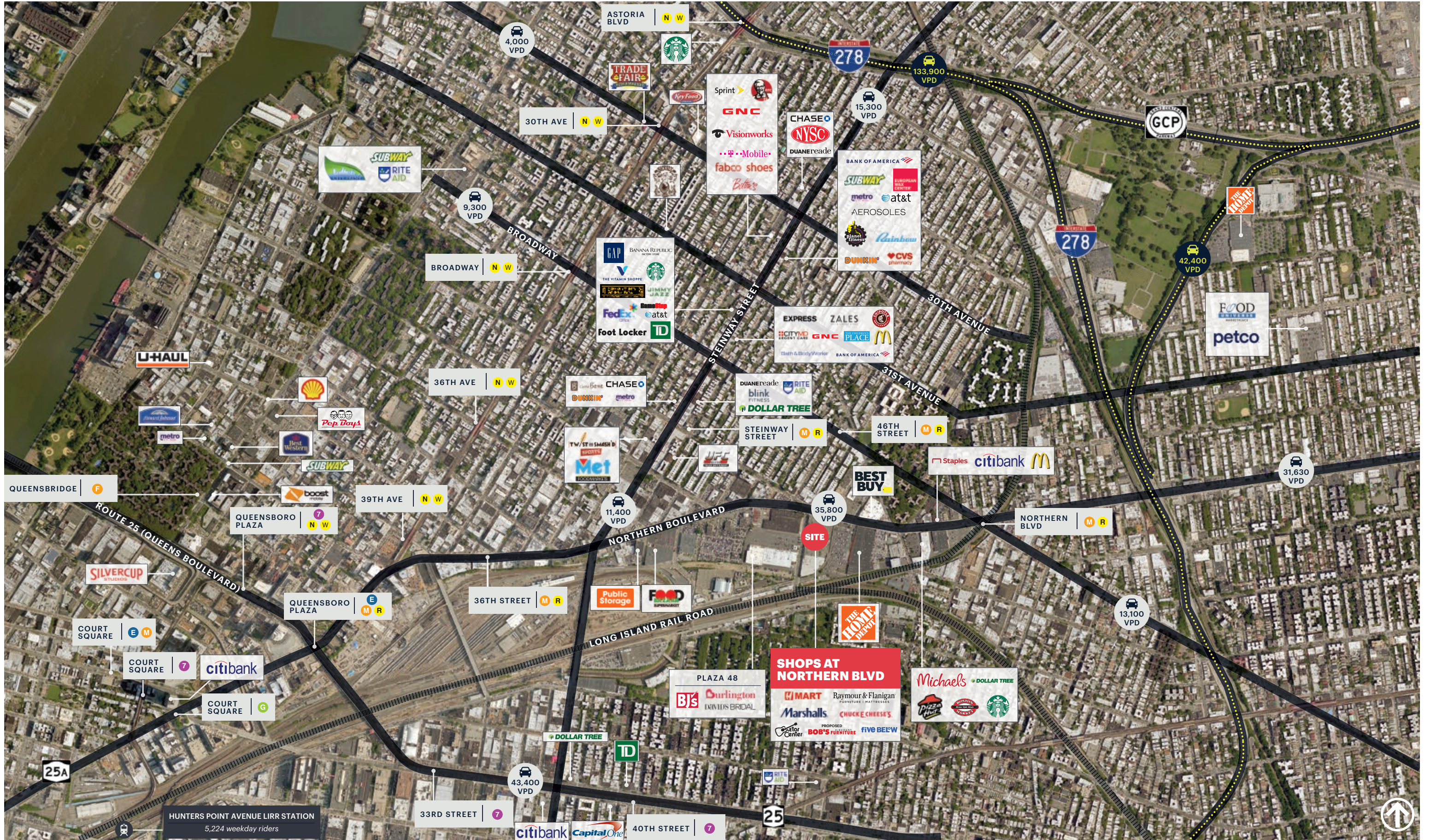
SHOPS AT NORTHERN BOULEVARD LONG ISLAND CITY, NEW YORK