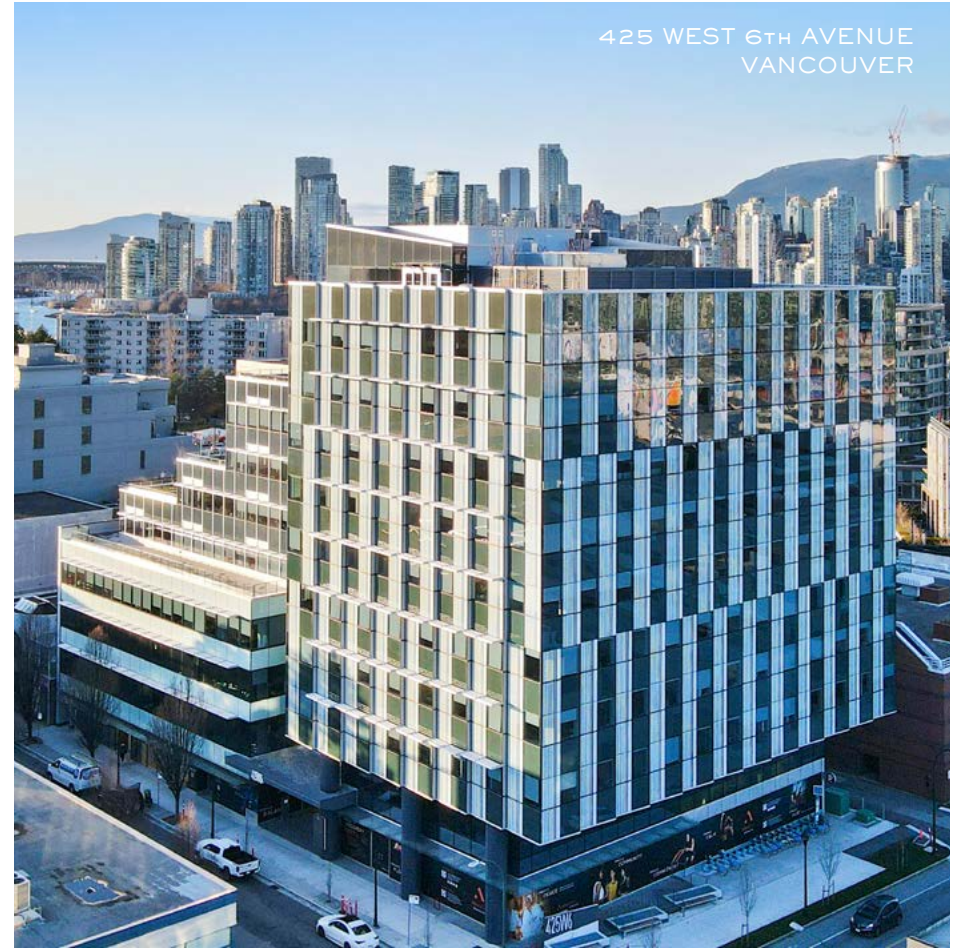
425 WEST 6TH AVENUE VANCOUVER