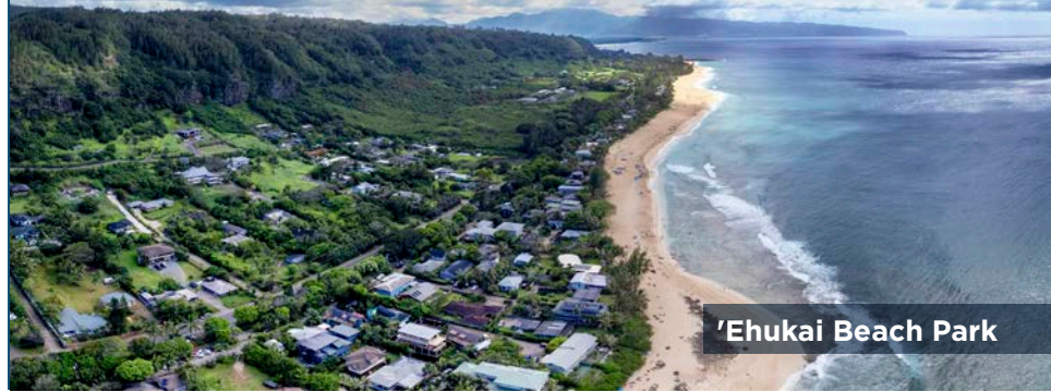
'Ehukai Beach Park