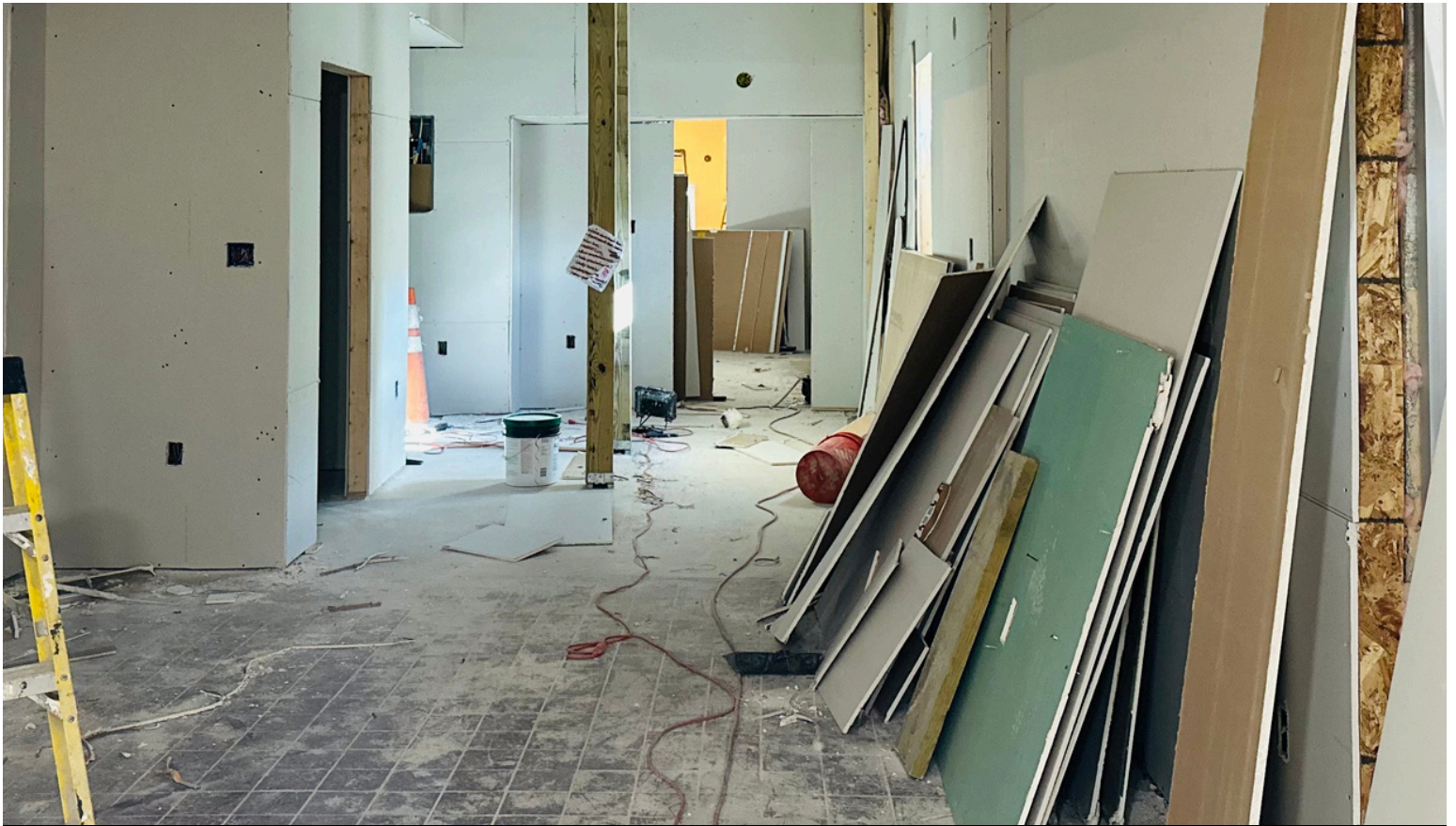
Interior - Currently Under Renovation