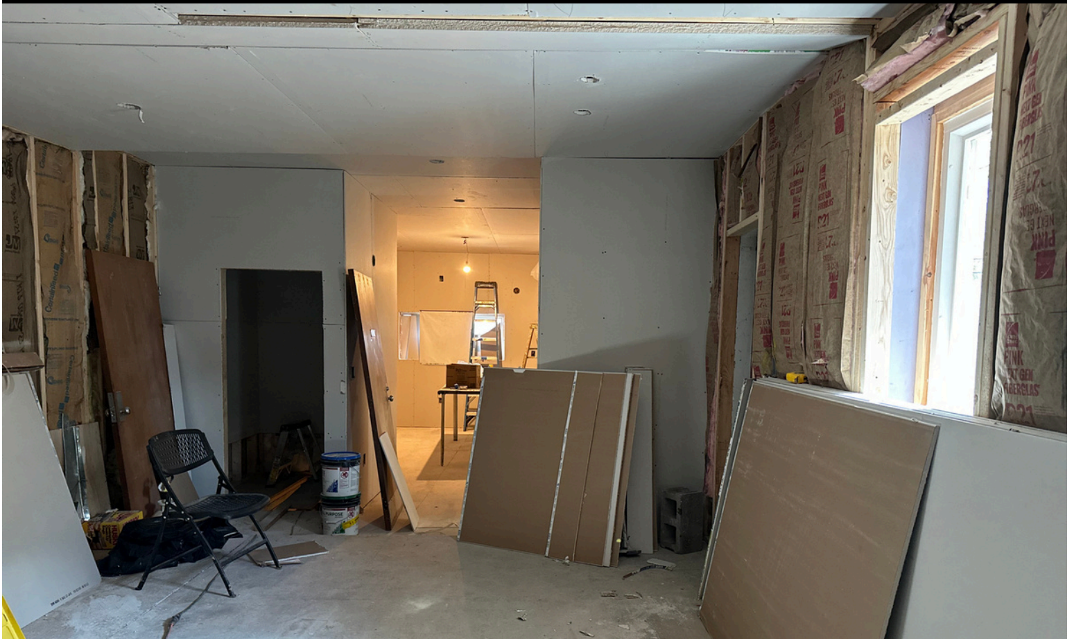
Interior - Currently Under Renovation