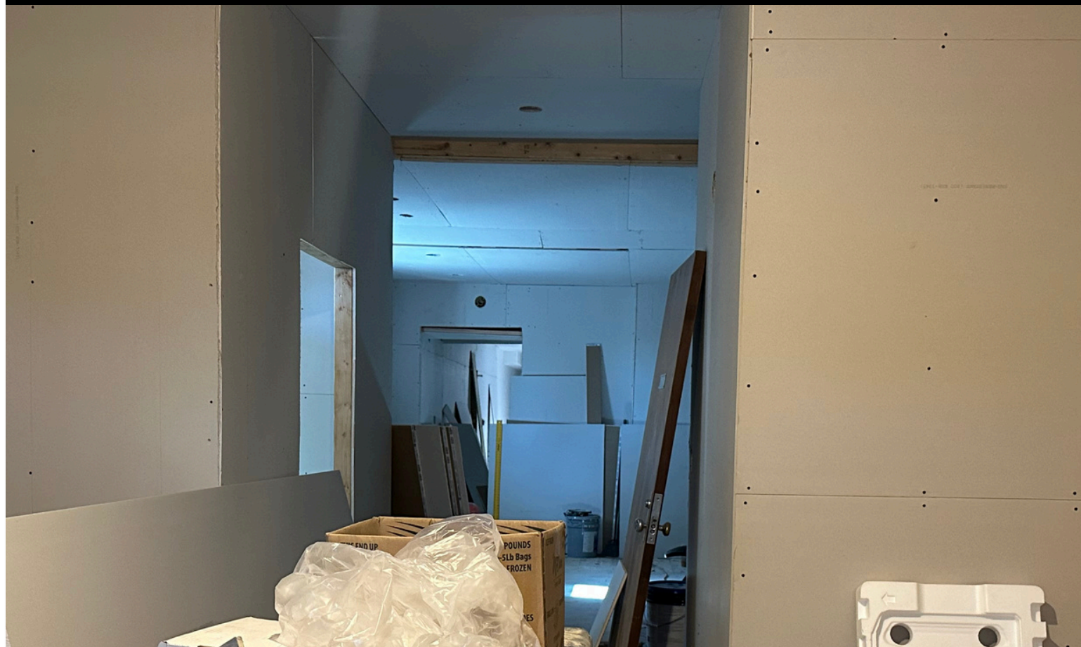
Interior - Currently Under Renovation