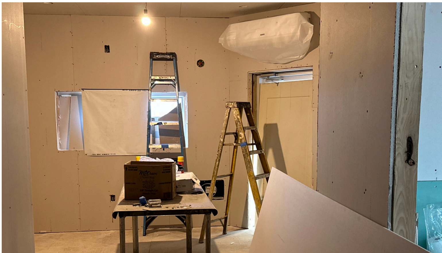
Interior - Currently Under Renovation