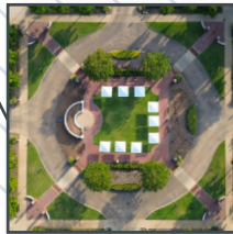
Community Hub for Center Events