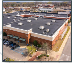
Former Bed Bath & Beyond Opportunity 28,307 SF