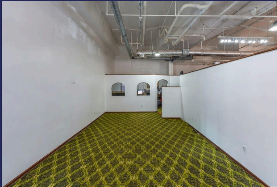
750 SF OPEN-SPACE WITH PRIVATE ENTRANCE