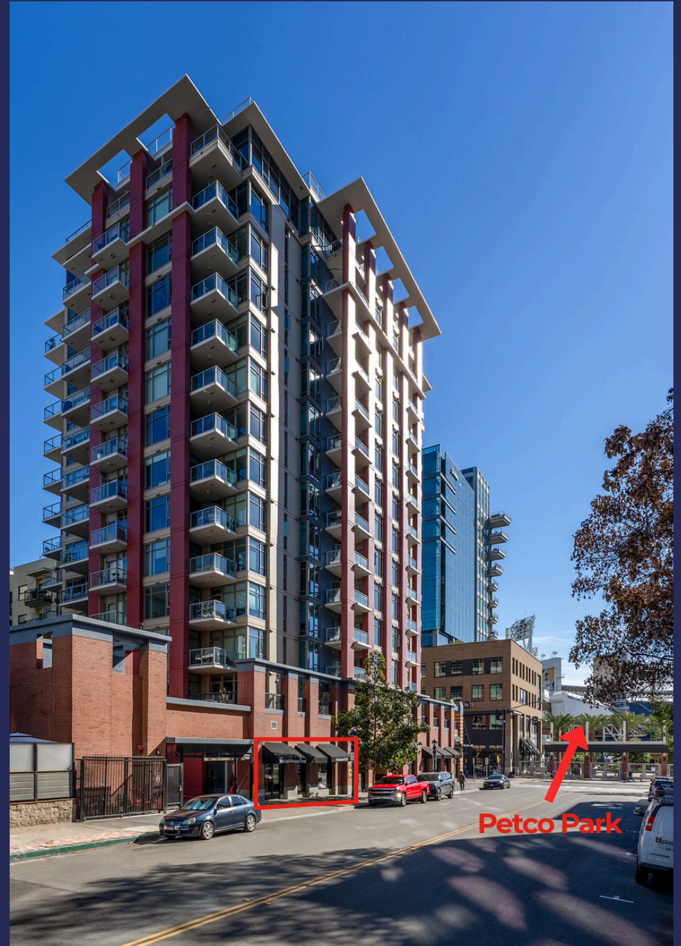
GROUND-FLOOR OF 113 RESIDENTIAL UNITS & CO-TENANT WITH 7/11 + RESTAURANTS