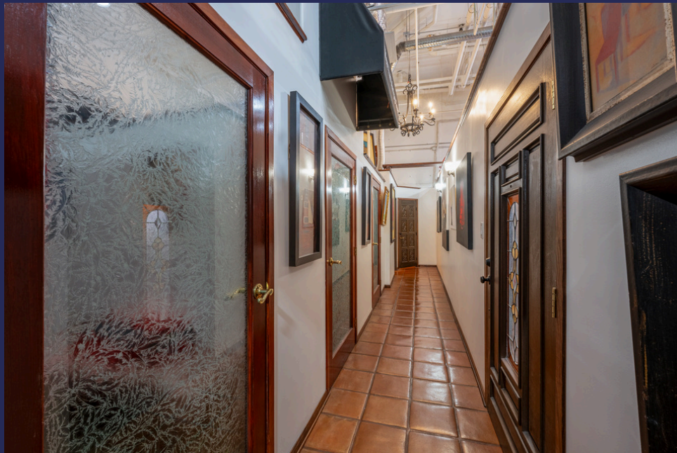
4 OFFICE / STORAGE ROOMS + RESTROOM