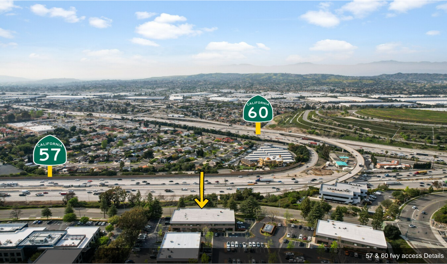
57 & 60 fwy access Details