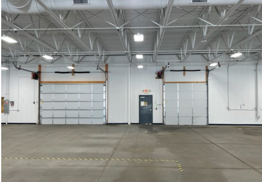
Two drive-in doors

1467 Lake Street South, Forest Lake, MN 55025