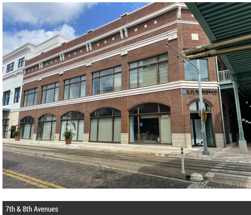
7th & 8th Avenues