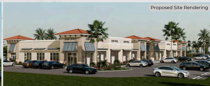
Proposed Site Rendering