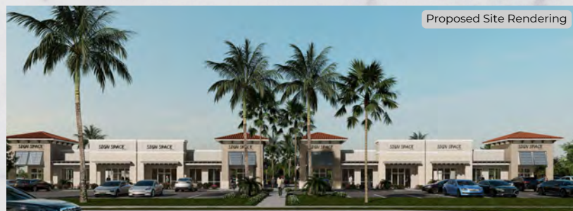
Proposed Site Rendering