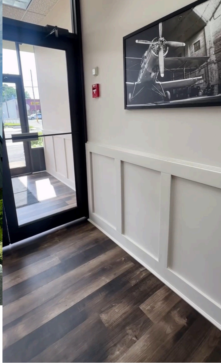
New Lobby Designs