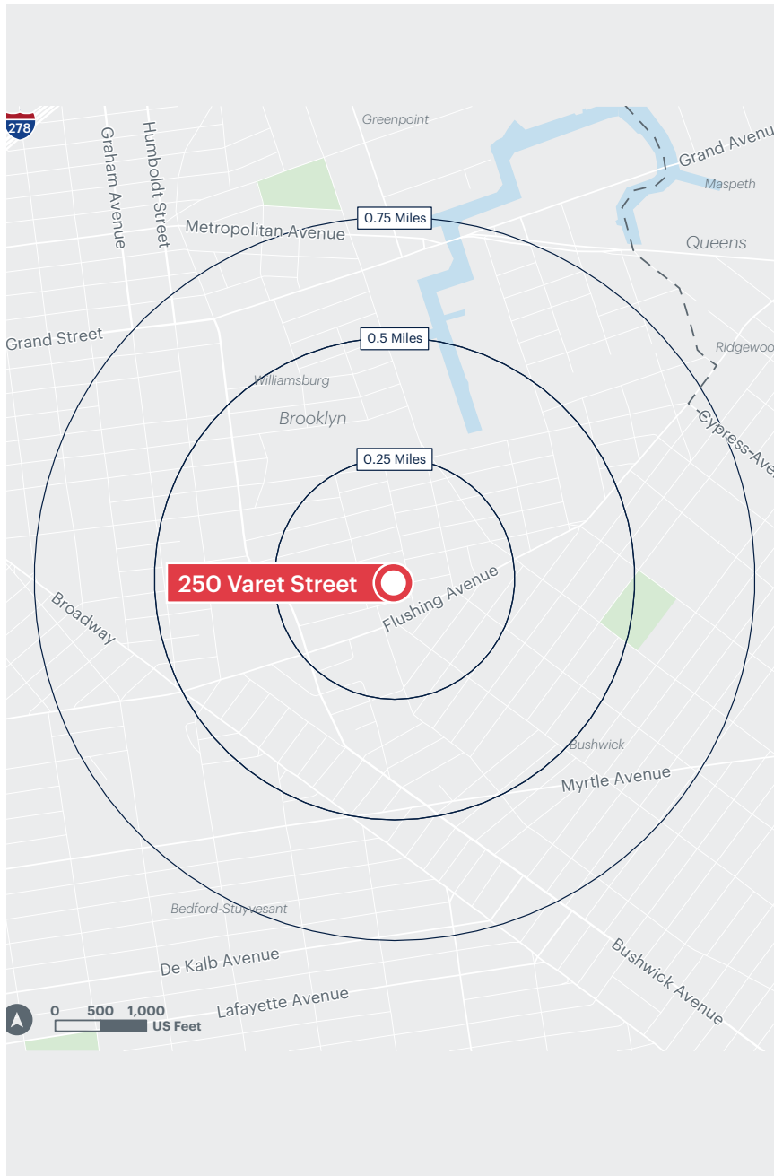
Demographic Ring Map