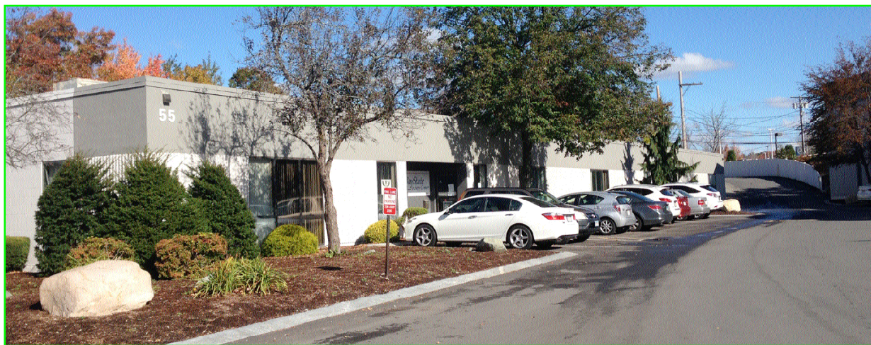
55 Providence Highway