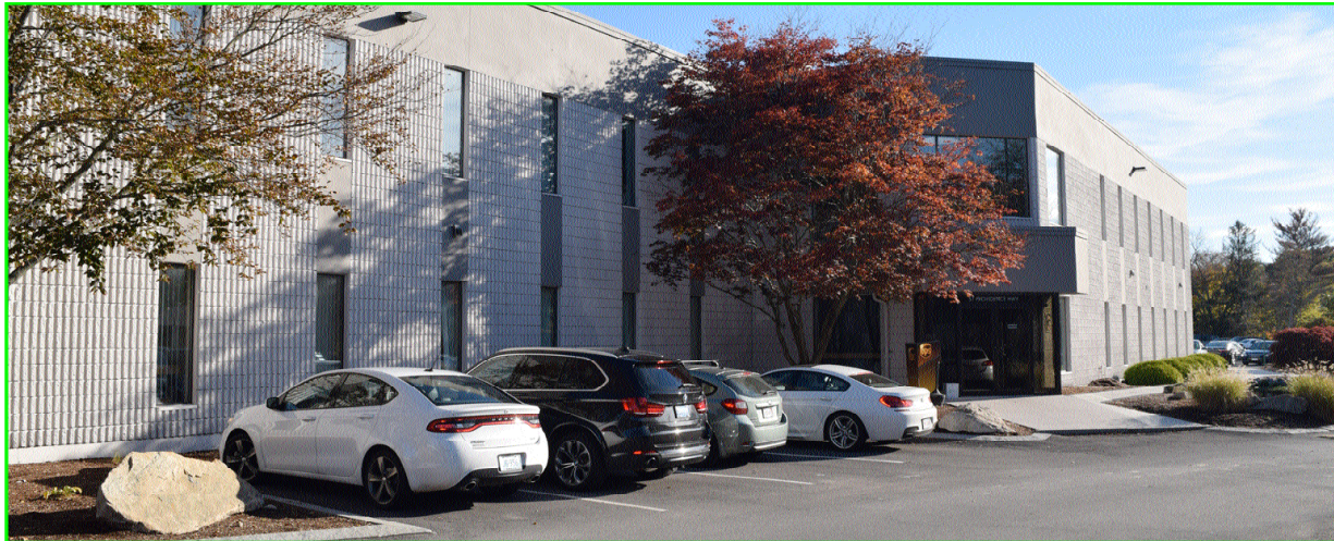
57 Providence Highway

Northeast Commercial, Inc. is pleased to present to you the Ro-Jo Office Park located at 55 & 57 Providence Highway (Route 1) in Norwood Massachusetts. This premier modern office park consists of two buildings totaling 40,000 square feet of prime office space. 55 Providence Highway is a single story building consisting of 12,000 square feet and 57 Providence Highway is a two story building consisting of 28,000 square feet. The park is strategically located only 1 mile from Route 128 on the southbound side of Route 1, better known as the "Automile". If you are looking for a Great Location, Corporate Identity, Flexible Efficient Floor Plans, Aggressive Lease Terms and the Best Value in the area, look no further than the Ro-Jo Office Park!