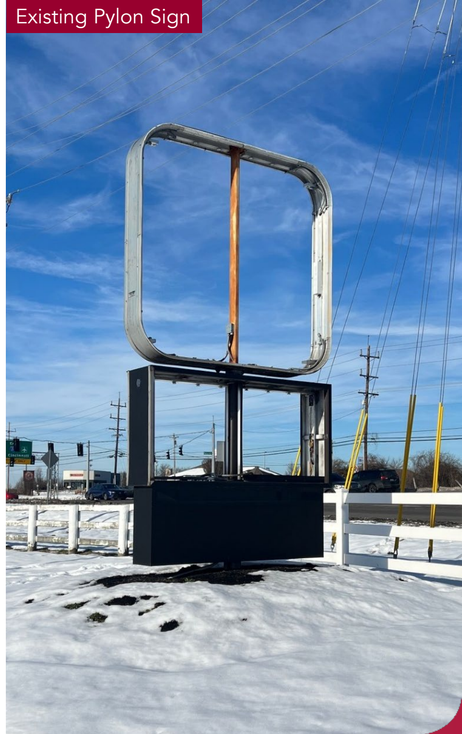
Existing Pylon Sign