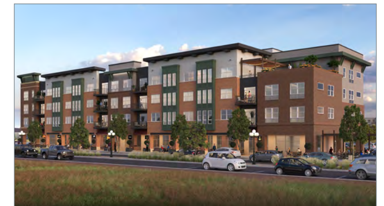
Mainstreet - Corner View