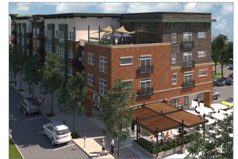
Rooftop / Patio & Outdoor Seating Area