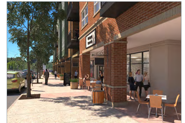
Mainstreet - Street View