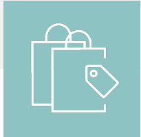
Surrounded by multiple walkable amenities