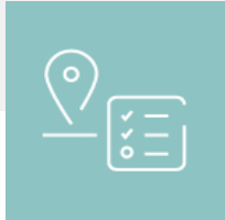
Unparalleled location & access to major expressways and highways