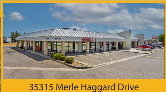
35315 Merle Haggard Drive

35315 Merle Haggard Drive Bakersfield, CA 93308