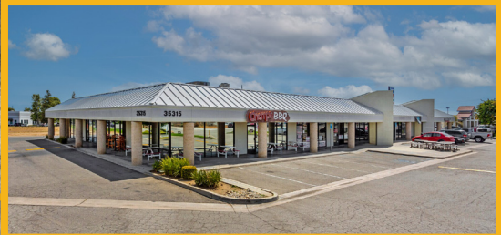
35315 Merle Haggard Drive