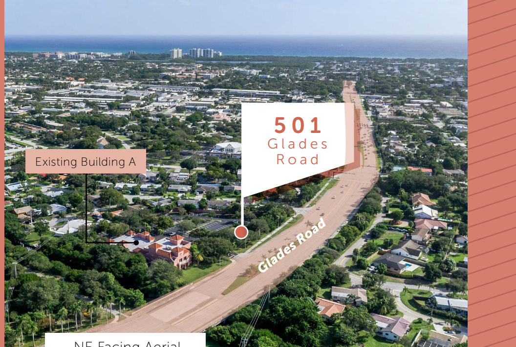
NE Facing Aerial