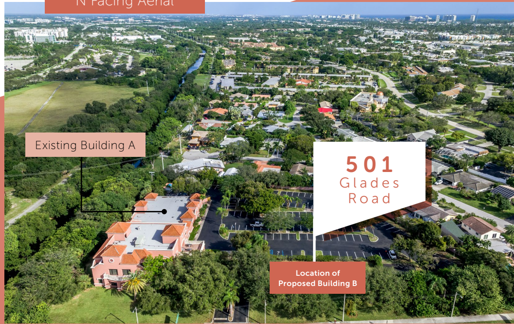
N Facing Aerial