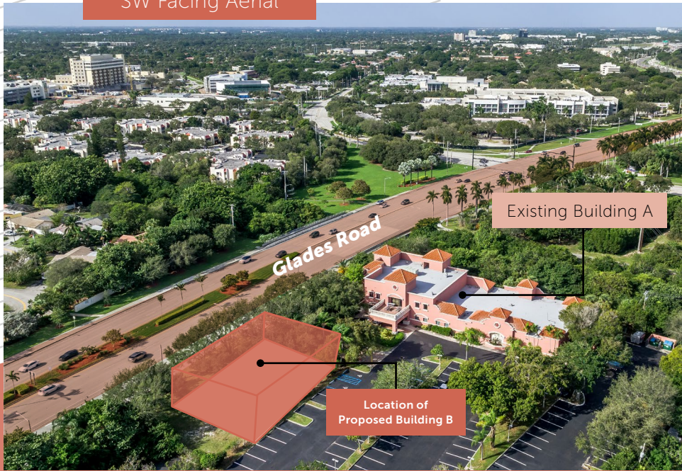
SW Facing Aerial