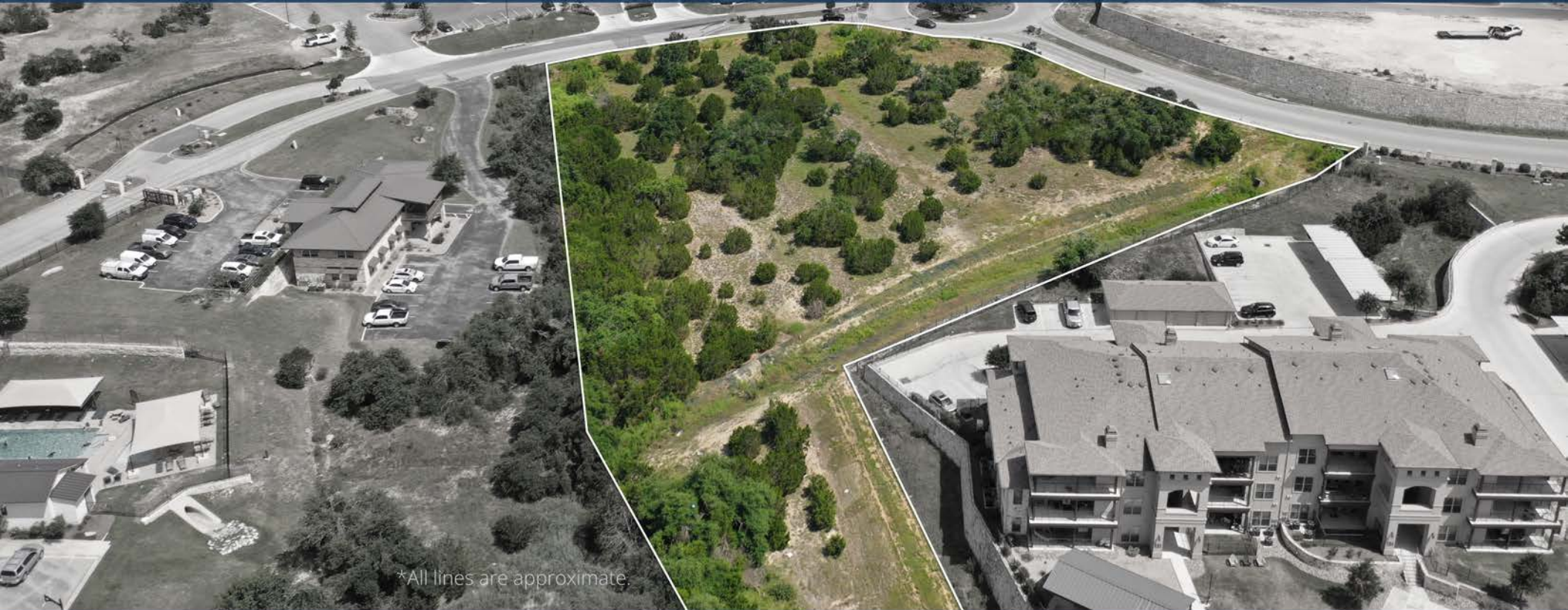
*All lines are approximate.