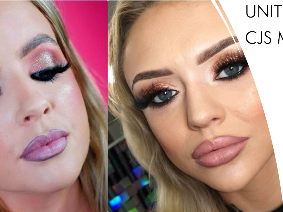
UNIT 38 CJS MAKE UP