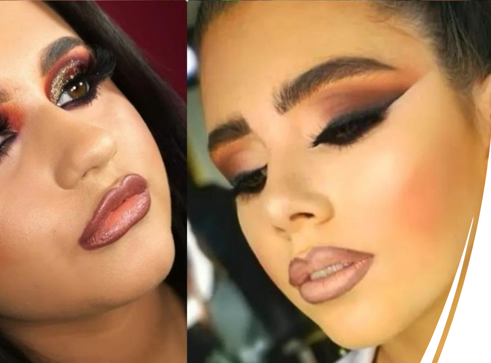
UNIT 42 LASER LAB