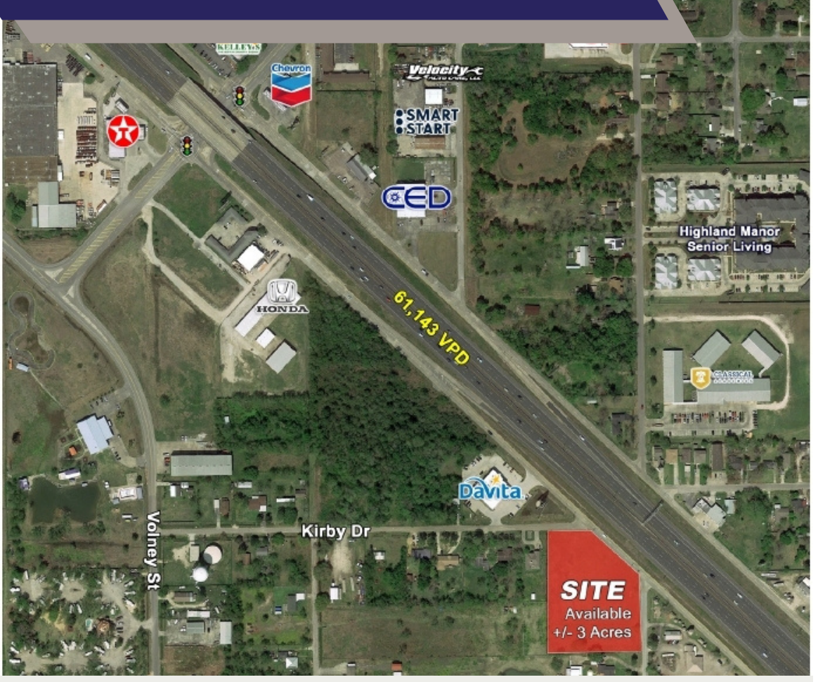
Major Area Retailers