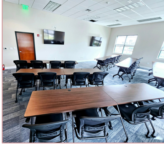
St. Lucie West Meeting Room Space