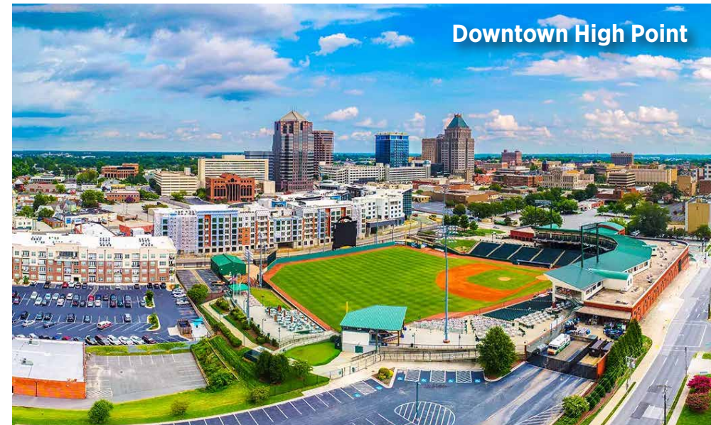
Downtown High Point

High Point, North Carolina, is a dynamic city in the Piedmont Triad—just southwest of Greensboro and Winston-Salem—celebrated worldwide as the “Furniture Capital of the World.” Founded in 1859 at the highest elevation on the North Carolina Railroad, it originally thrived through furniture and textile manufacturing, hosting its first furniture exposition in 1905. Today, the biannual High Point Market—first held in 1909—remains the globe’s largest home furnishings trade show, drawing 70,000–80,000 buyers across more than 11 million square feet. With a population of around 114,000, the city melds small-town charm with regional significance, offering a mild climate, strong schools, and top-tier healthcare. Beyond its industrial roots, High Point boasts a revitalized downtown—anchored by galleries in Congdon Yards, local breweries, and the quirky landmark “World’s Largest Chest of Drawers”—as well as cultural attractions like the High Point Museum, Nido & Mariana Qubein Children’s Museum, and scenic parks such as City Lake Park