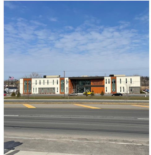
New Development Across the Street

DAVIS YOHE 315.928.1500 davis@c21bridgeway.com