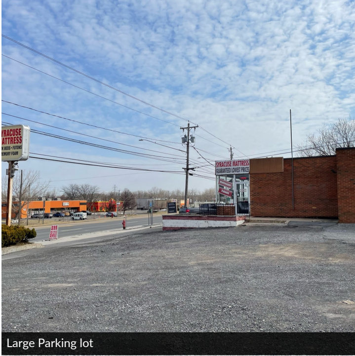
Large Parking lot