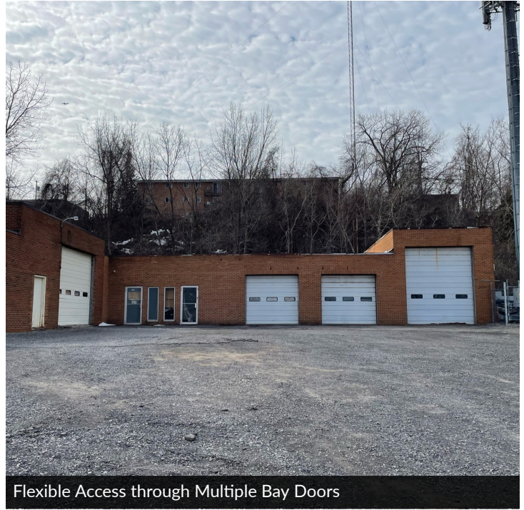
Flexible Access through Multiple Bay Doors