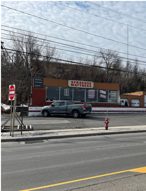
Highly Visible Location