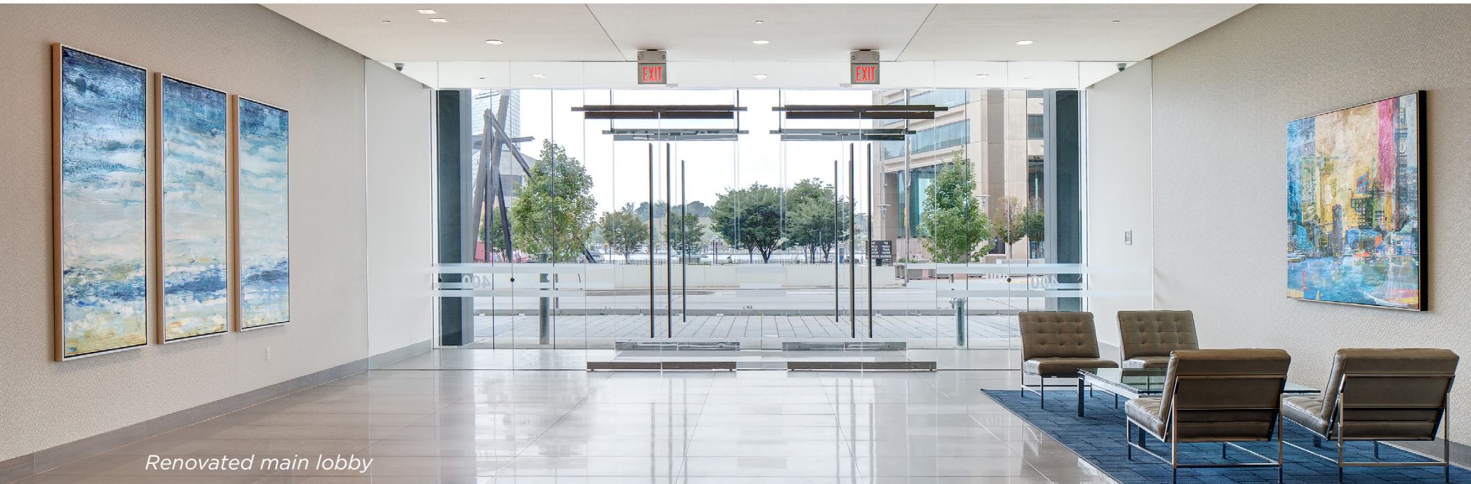
Renovated main lobby

Attached garage with over 1,300 parking spaces, offering a ratio of 4.0 per 1,000 SF leased