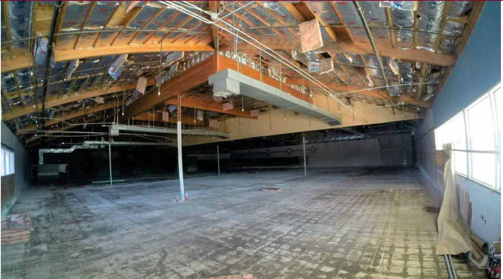
Former Rite Aid - Cold Shell Condition