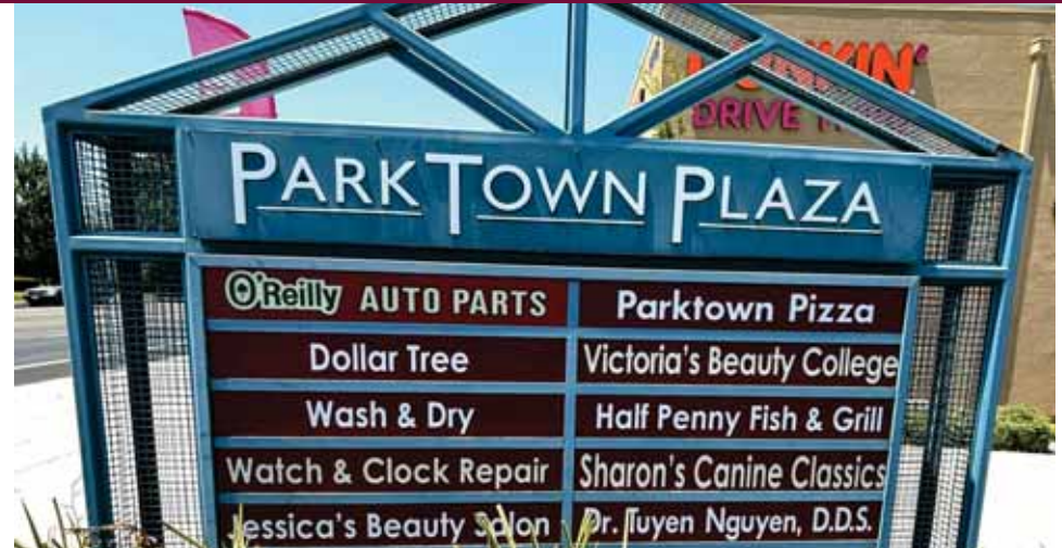
Monument Sign - Landess Avenue