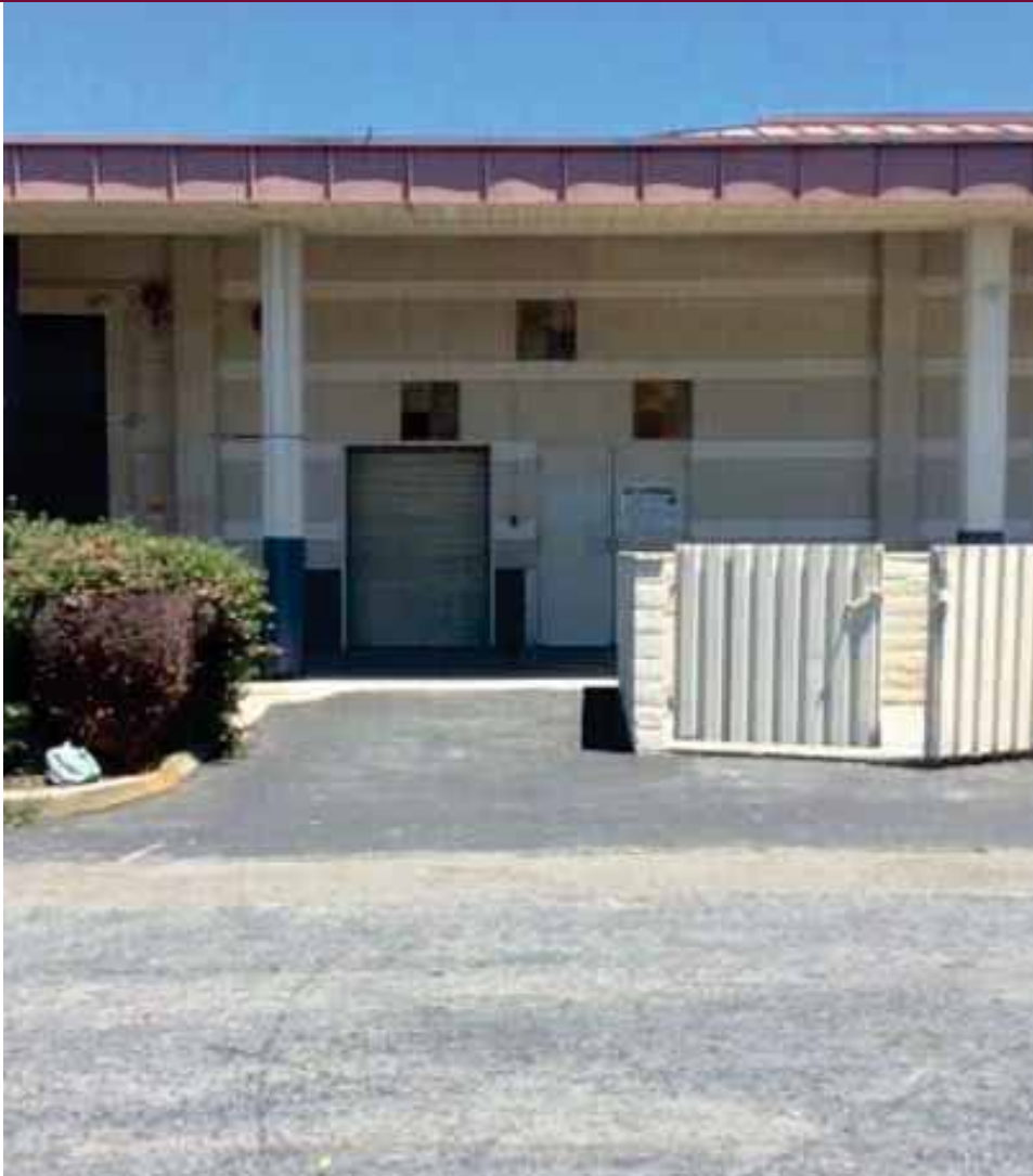
Shipping/Receiving Area - 6' Wide Roll Up Door