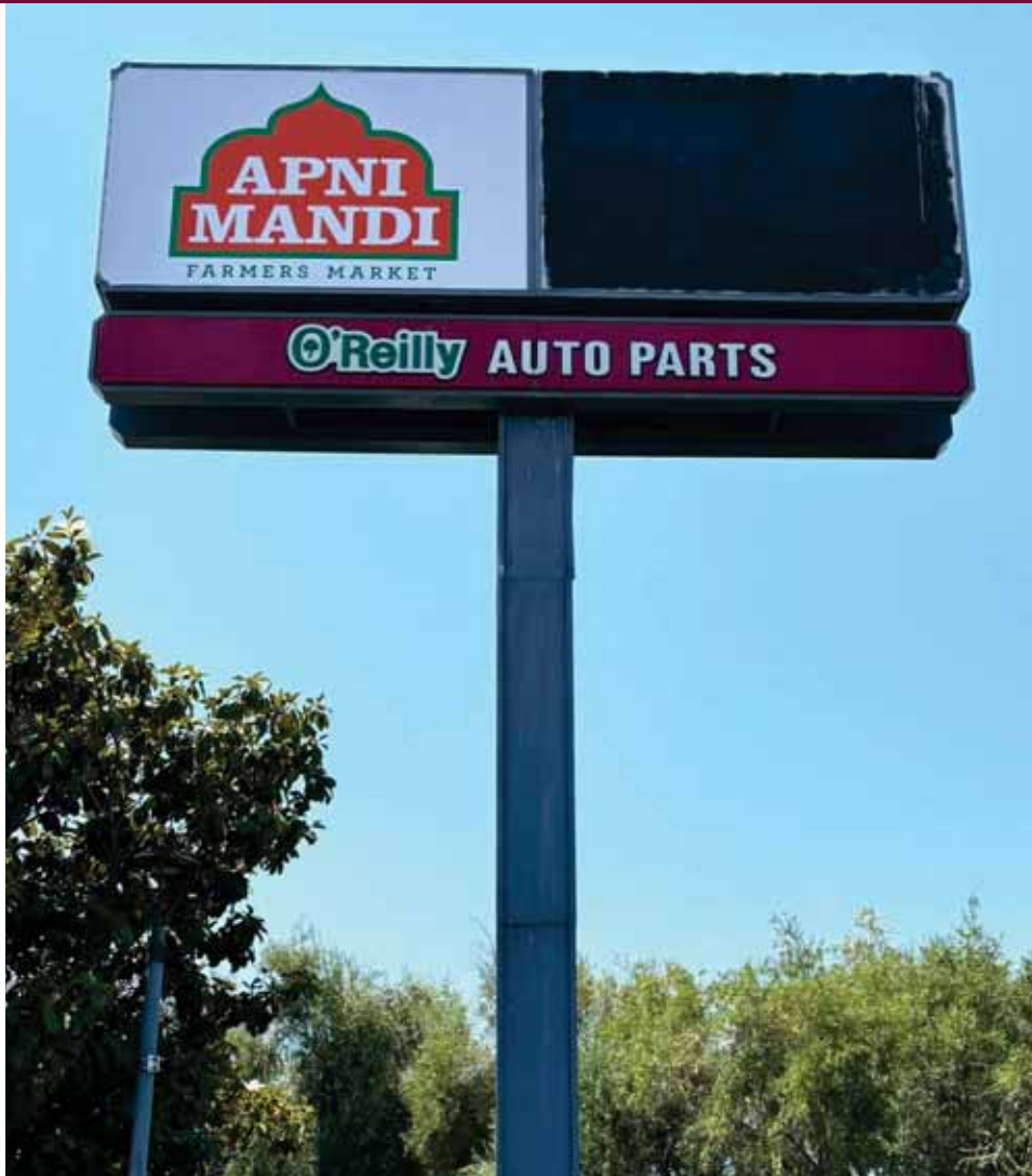
Pole Sign - Fantastic Branding