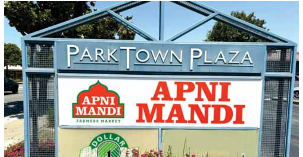
Monument Sign - S. Park Victoria Drive