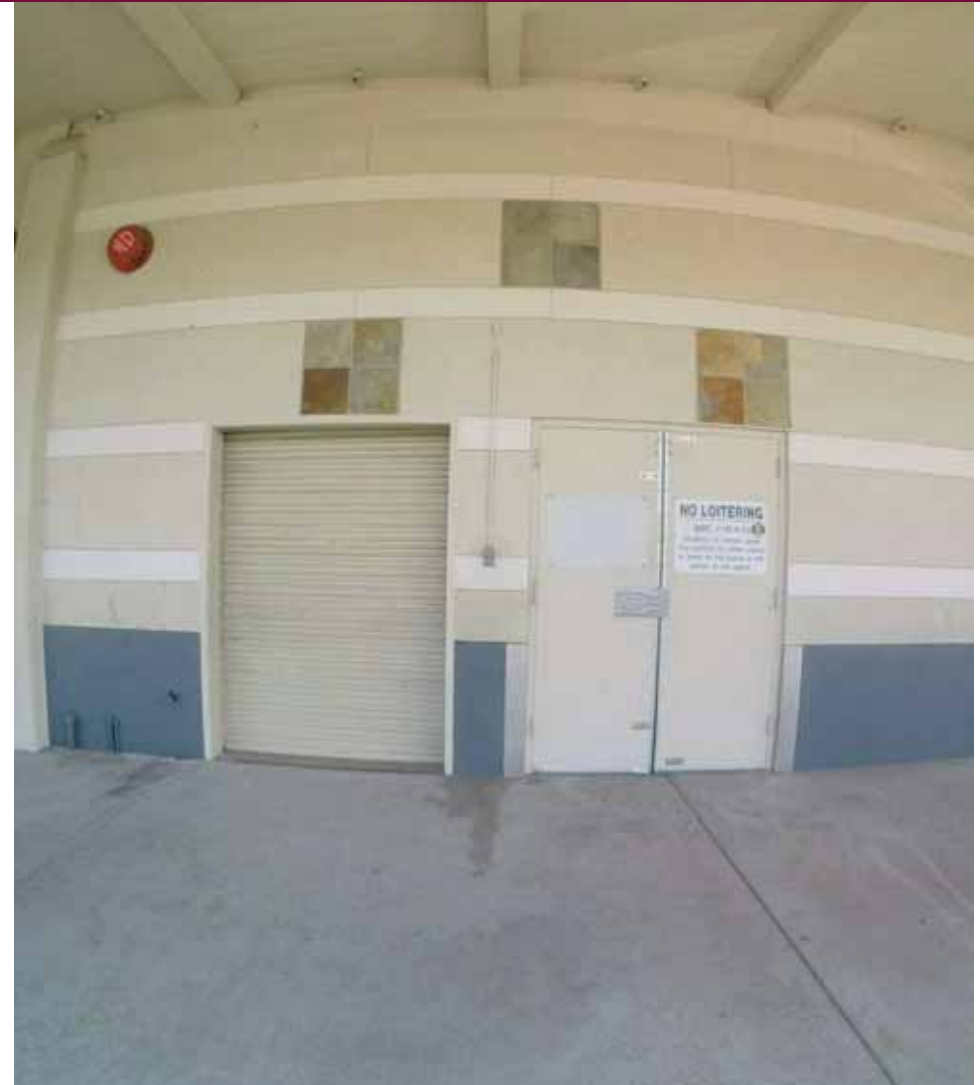
Shipping/Receiving Area - 6' Wide Double Steel Man Doors